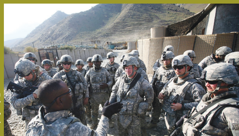
U.S. troops in eastern Afghanistan near Pakistani border, October 24, 2008.

Will you fight for the changes that got you to put your hopes in Obama? Or will you "wait and see"? But how long will you wait, and how much will you have to see? What will you find intolerable? At what point will you step up and resist?