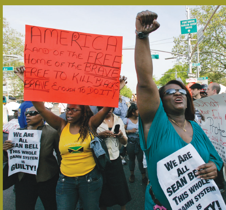
Protesting the Sean Bell verdict, May 7, 2008 in New York.

There's going to be storms. You can sit and let it pour down on the people, here and all over the world, or you can do something to wrench a whole better future out of it.