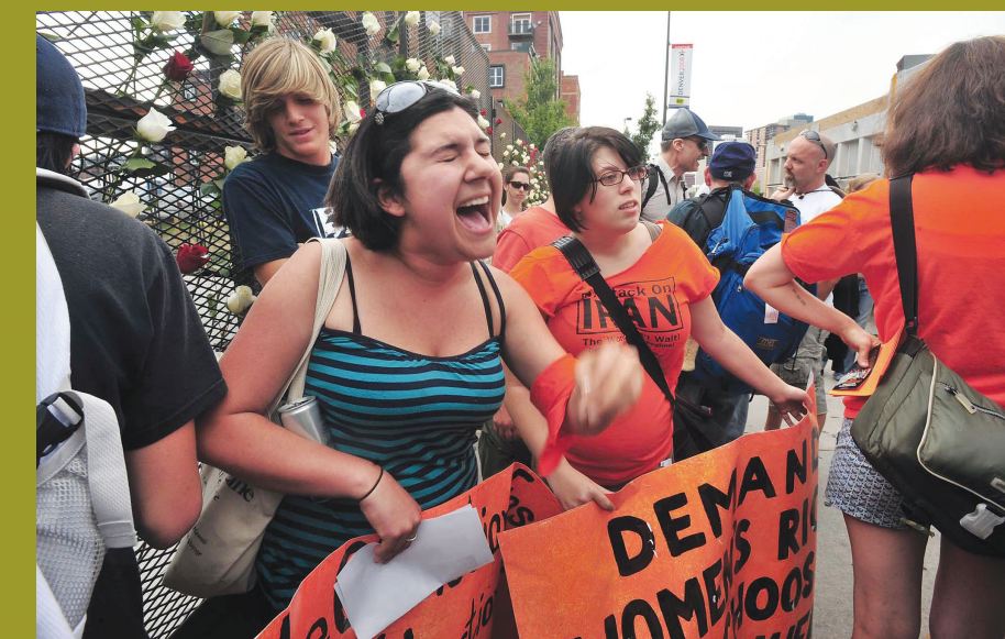
Abortion rights supporters at the Democratic National Convention, August 2008.