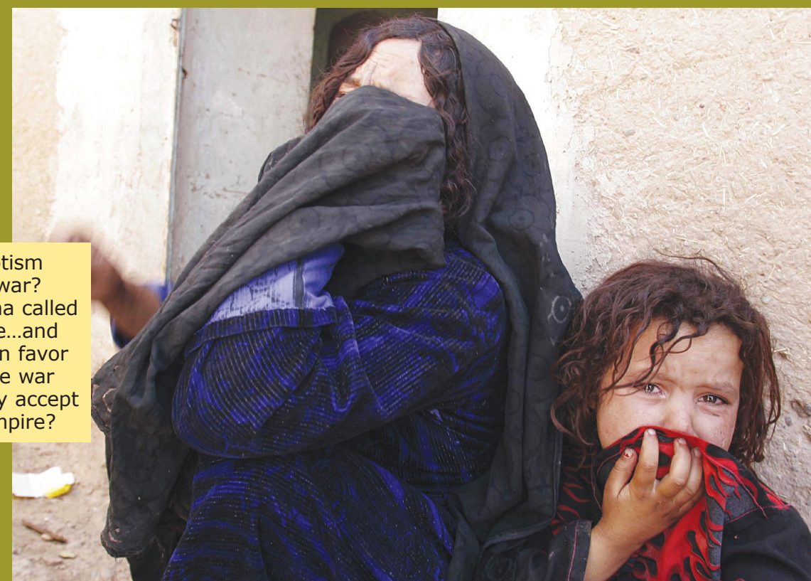
Afghan woman and her daughter grieve the death of a relative killed in a U.S. air strike in Azizabad, Afghanistan, August 23, 2008.