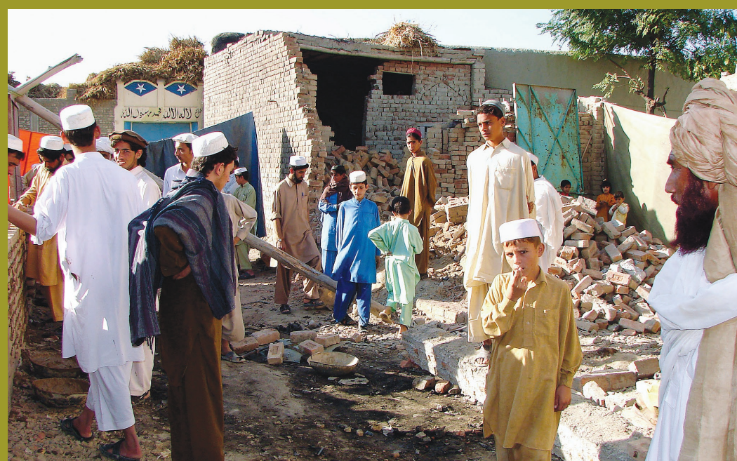
Pakistan homes destroyed by U.S. air strike along the border with Afghanistan, November 1, 2008.

What are you gonna do as Obama trains people to think in terms of patriotism and "the greatness of America" when this is being used as a rallying cry for war? Obama has called for shifting troops out of Iraq...and into Afghanistan. Obama called Iran "one of the greatest threats to the United States, Israel and world peace...and we should take no option, including military action, off the table." And he is in favor of the U.S. taking unilateral military action in Pakistan. If Obama steps up the war in Afghanistan and Pakistan or launches a war against Iran, will you passively accept and go along with this? Or will you resist such steps in an endless war for empire?