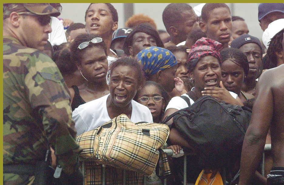
New Orleans residents try to evacuate after Katrina, September 2005.