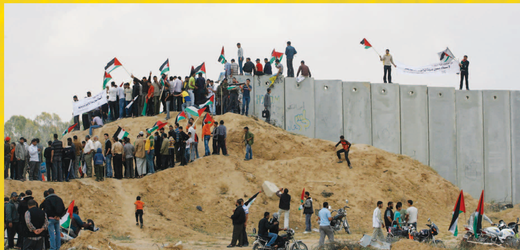
May 15, 2011, protesters at the Rafah border crossing between Egypt and the Gaza Strip. Some 1.5 million Palestinians driven from what is now Israel, and their families, live in Gaza.

Israel has been a catastrophe for the people of the world. Look up Israel's "special relationship" with apartheid South Africa when that openly racist regime was isolated and exposed. Look up the role of Israel in the "dirty war" of terror waged by Argentina's fascist (and virulently anti-Semitic) junta against radicals and dissidents from 1976 to 1983. Or Israel's role in backing the Shah of Iran. Or look up what happened in Guatemala, from 1978 to 1984 when the Christian fundamentalist butcher Ríos Montt killed at least 180,000 Mayan peasants. Villagers were beheaded, systematically raped, pregnant women were slaughtered, and Mayan children were sold or given as slaves to functionaries of the fascist Guatemalan regime. In 1982, as exposures of these massacres were coming to light, the New York Times reported that U.S. "Secretary of State Alexander M. Haig Jr. prompted Israel to do more in Guatemala." Israel played an essential and central role in the epic slaughter—supplying transport to remote villages, war planes, military training, "advisors," and 10,000 Uzis. In 1982, under the direction of the U.S. military, Israeli commanders devised and helped implement a scorched earth policy (burn all, kill all) for the Guatemalan highlands.