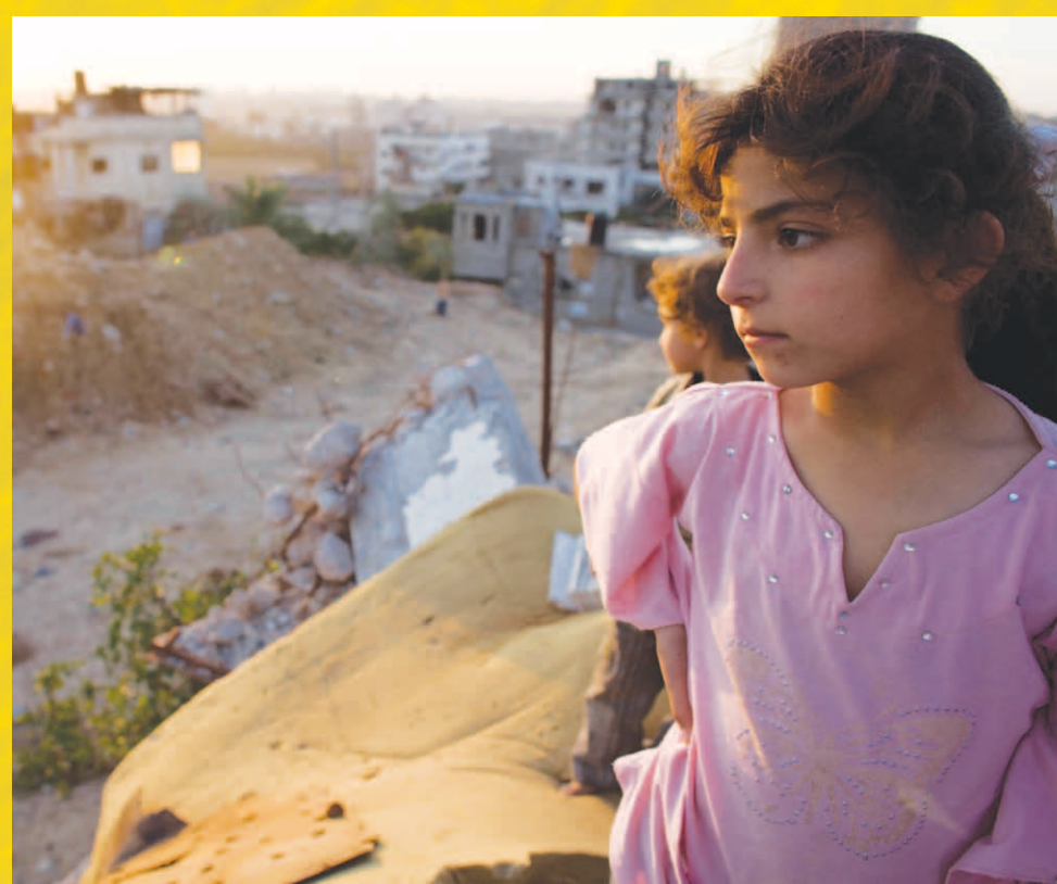
A young Palestinian looks out on Israeli-destroyed buildings in Gaza, 2009. More than 1,000 people were massacred in Israel's one-sided war on Gaza.

See online resources and documentation at revcom.us/israel... and/or look up the assertions here yourself.