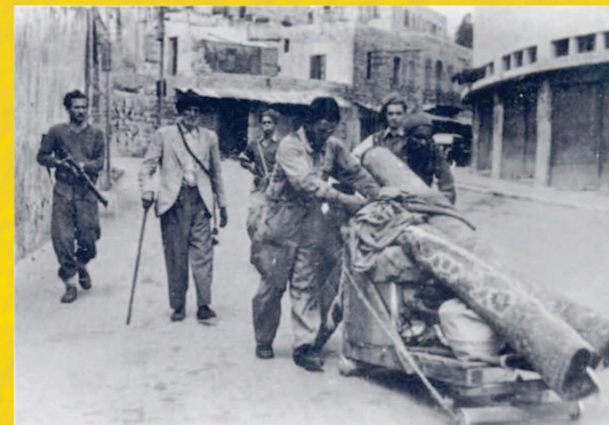
Palestinians forced from the city of Haifa by Israeli forces in 1948—nearly a million Palestinians were driven from their homeland during the "Nakba."

Right: Al Tanf Refugee Camp in Syria near the Iraq border. More than 1,000 Palestinian refugees fleeing targeted violence in Iraq in the aftermath of the U.S. invasion lived in tents in summer temperatures of 100 degrees and near zero winter weather—for four years. The camp was closed in 2010, with residents relocated to yet another refugee camp in Syria that the UN calls "slightly better" but "not sustainable."