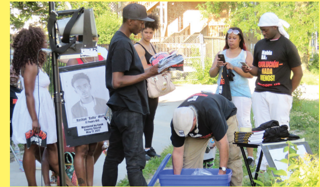
Getting into Revolution t-shirts on Chicago's Southside

Bob Avakian says, "We, the masses of people, are capable of much greater things than this. We are capable of completely and radically changing our circumstances, changing all of society to get rid of circumstances like these. What happens in the world affects us and we can affect the world, and when all is said and done, we can change the whole world, together with people like us all over the world."