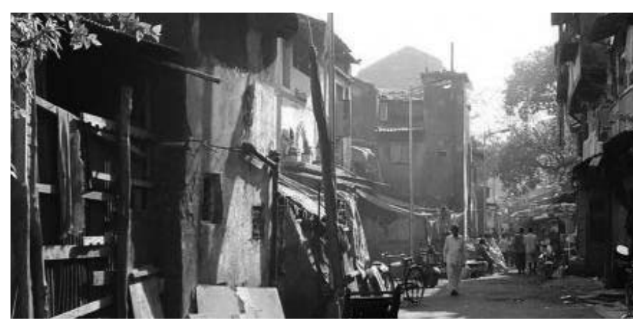
Red light district in Mumbai, India, 2013.