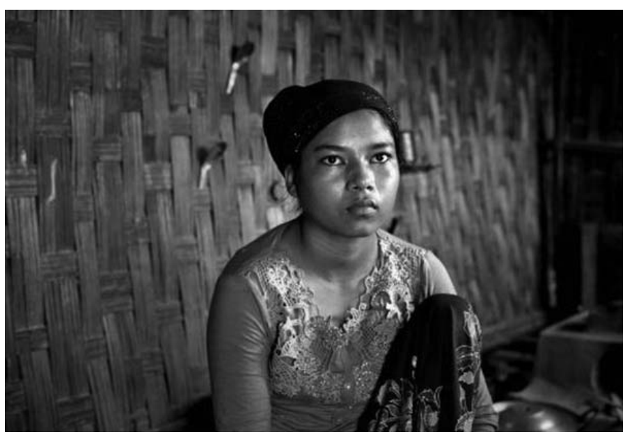
This 17-year-old refugee woman of the Rohingya ethnic minority escaped genocidal assault in Myanmar only to be trafficked to one of Bangladesh's so-called "brothel villages" from which she fled by boat.

know the trauma they will suffer if they ever get out of it like she did.<sup>32</sup>