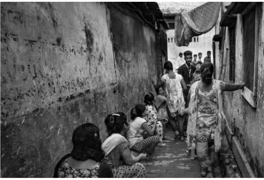
Girls in a brothel in Bangladesh. Of the country's 140,000 women and girl prostitutes, the overwhelming majority are trafficked and enslaved.