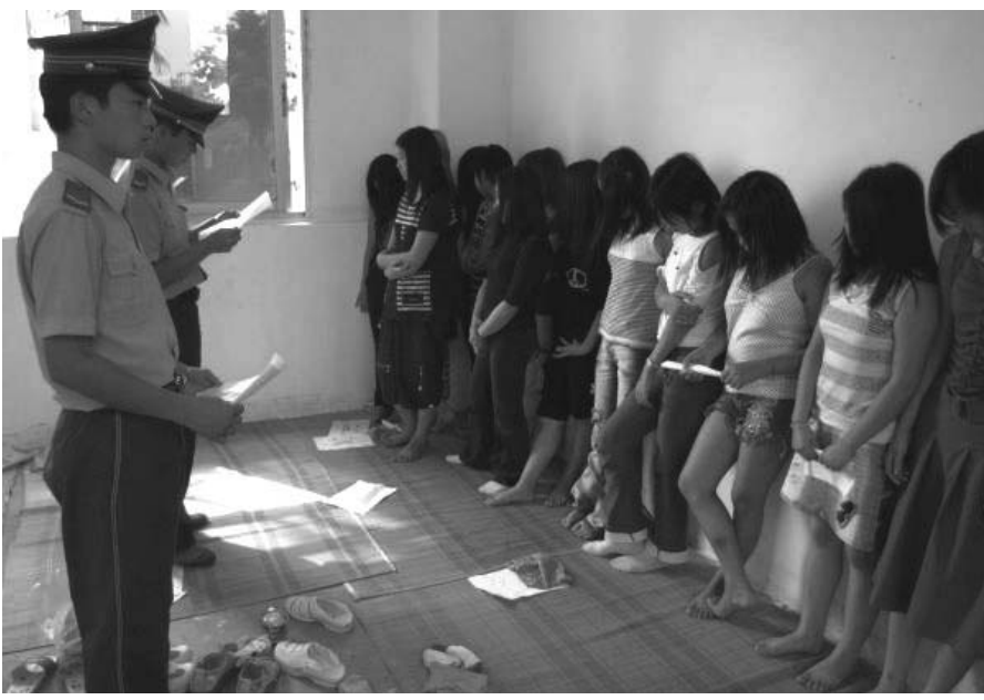
Paramilitary officers in Xiamen in southeastern China detain girls and young women who were among those caught when a smuggling operation into Taiwan was stopped, 2003.

work"...she becomes a slave. Even though most of her prostitution "earnings" are apportioned to a pimp or trafficker, she is able to send some funds home to her family in a rural village. In short, money is cycled back into the Thai economy and helps prop up this economy with, yes, its large "brothel sector" (about which more in section IX). Such is the matrix of dependent, imperialist-dominated development.