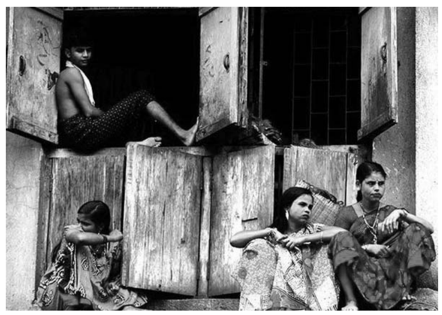
Women at a brothel in Kolkata, India, 2013.

desperate women seeking employment...and becoming prey to international traffickers. Between 1991 and 1998, some 500,000 Ukrainian women had been trafficked to Western countries for sexual exploitation.<sup>8</sup>