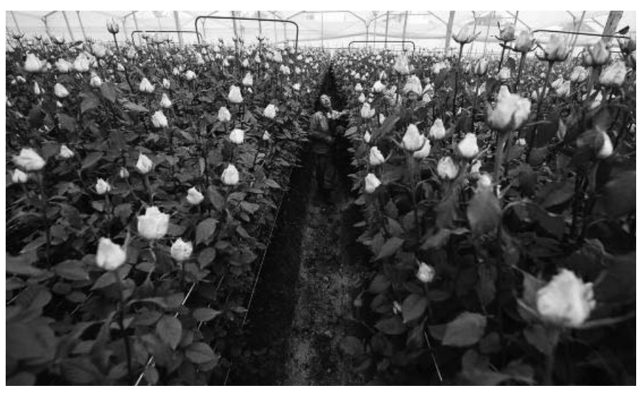
A woman in Colombia at a farm growing roses intended for export to the U.S.