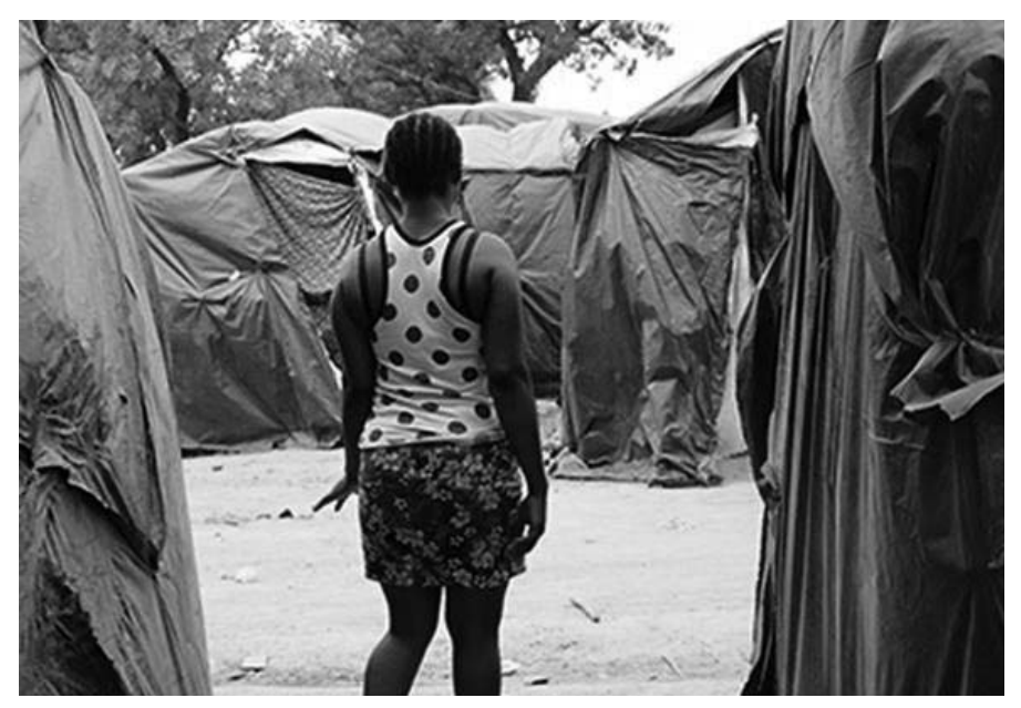
A Nigerian woman trafficked to Burkina Faso and forced into prostitution in the gold mining town of Secaco walks through a tent encampment where she and others like her live and are forced to have sex with up to 30 men per night.