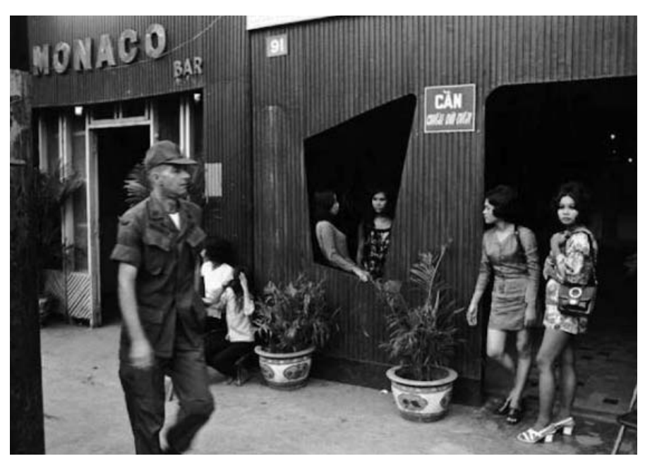
A U.S. GI walking past a brothel in South Vietnam during the Vietnam War. During 10 years of America's genocidal war in Vietnam (1965-75), between 400,000 and 500,000 Vietnamese women and girls became prostitutes.

The growth and globalization of the "sex industry" has a pivotal "supply side." A huge reservoir of displaced and desperate humanity, most especially in the Third World (but not only), is not being absorbed into the structures of the formal economies of the world imperialist system. Formal refers to set pay and hours and some degree of official regulation of working conditions. Rather,