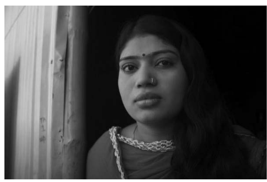
Young woman from Bangladesh who was trafficked when she was 9 years old and sold to a brothel when she was 13.

It is often argued in defense of "sex work" that, yes, it can be degrading...but so too are all manner of jobs under capitalism. In answering this, revcom.us published an article that points to the problem with this argument: