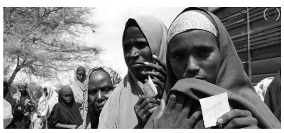
Ugandan women who were stopped at Nairobi airport in Kenya because they lacked proper employment papers. They were victims of a human trafficking ring in East Africa.

There are multiple research studies showing that pornography is a primary source of information about sex for young people—and that young boys in particular who view internet pornography regard its depiction of sex as "realistic."<sup>56</sup> Never mind consent based on equality, shared affection, and mutual pleasure.