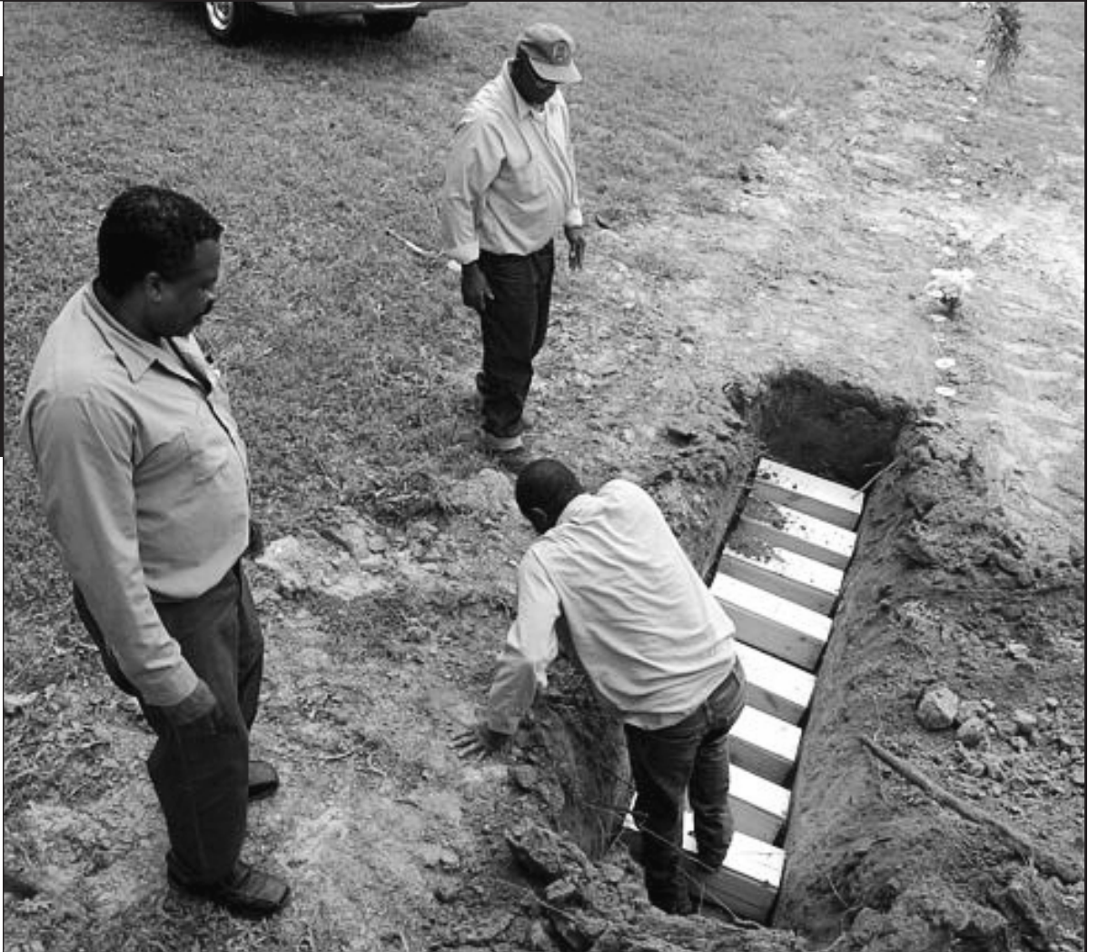
Prisoners working as grave diggers bury dead infants in Shelby County Cemetery in Memphis. More than 14,000 bodies, mostly babies, lie beneath the earth in this cemetery. Memphis has the highest infant mortality rate — twice the national average — among the nation's 60 largest cities. In Memphis, a Black infant is almost three times more likely to die in the first year than a white infant under the age of one.

The "infant mortality rate" is the number of babies who die before their first birthday for every 1,000 live births. In the United States, the infant mortality rate among Black people in 2004 was 13.6—almost two and a half times higher than the rate of 5.7 for white people.