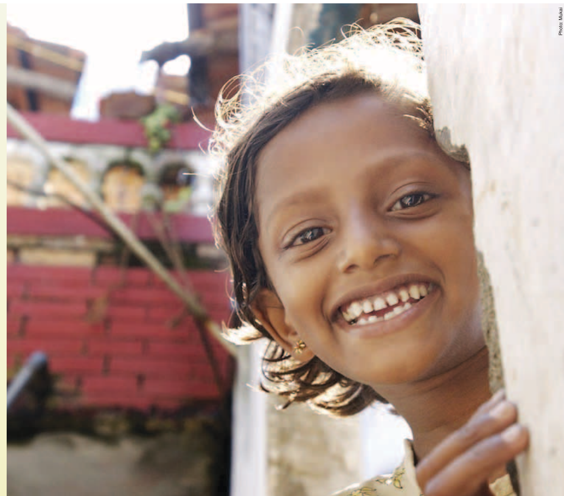
Sri Lanka, 2004