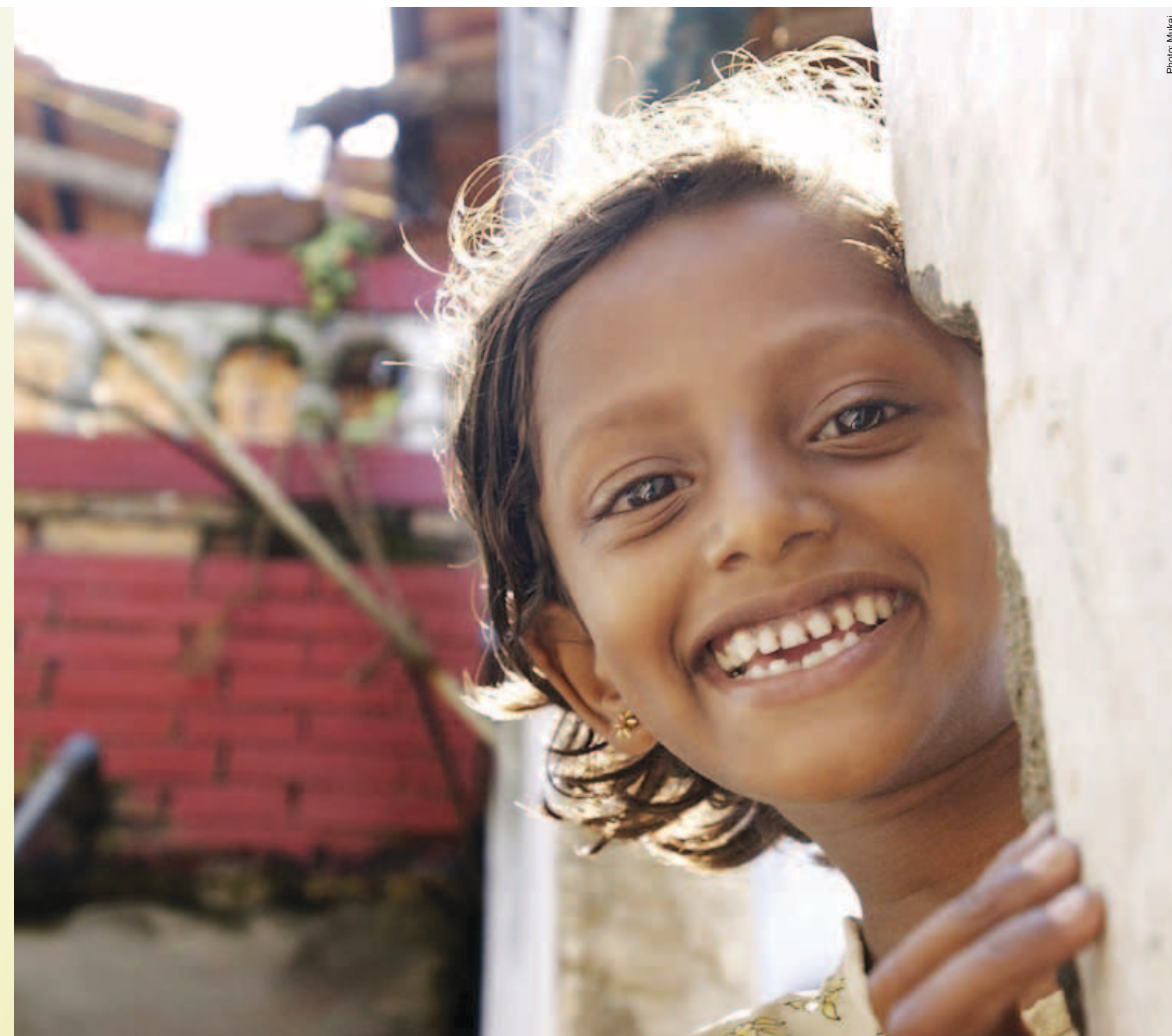
Sri Lanka, 2004

Bob Avakian Chairman of the Revolutionary Communist Party, USA BA sics 1:10