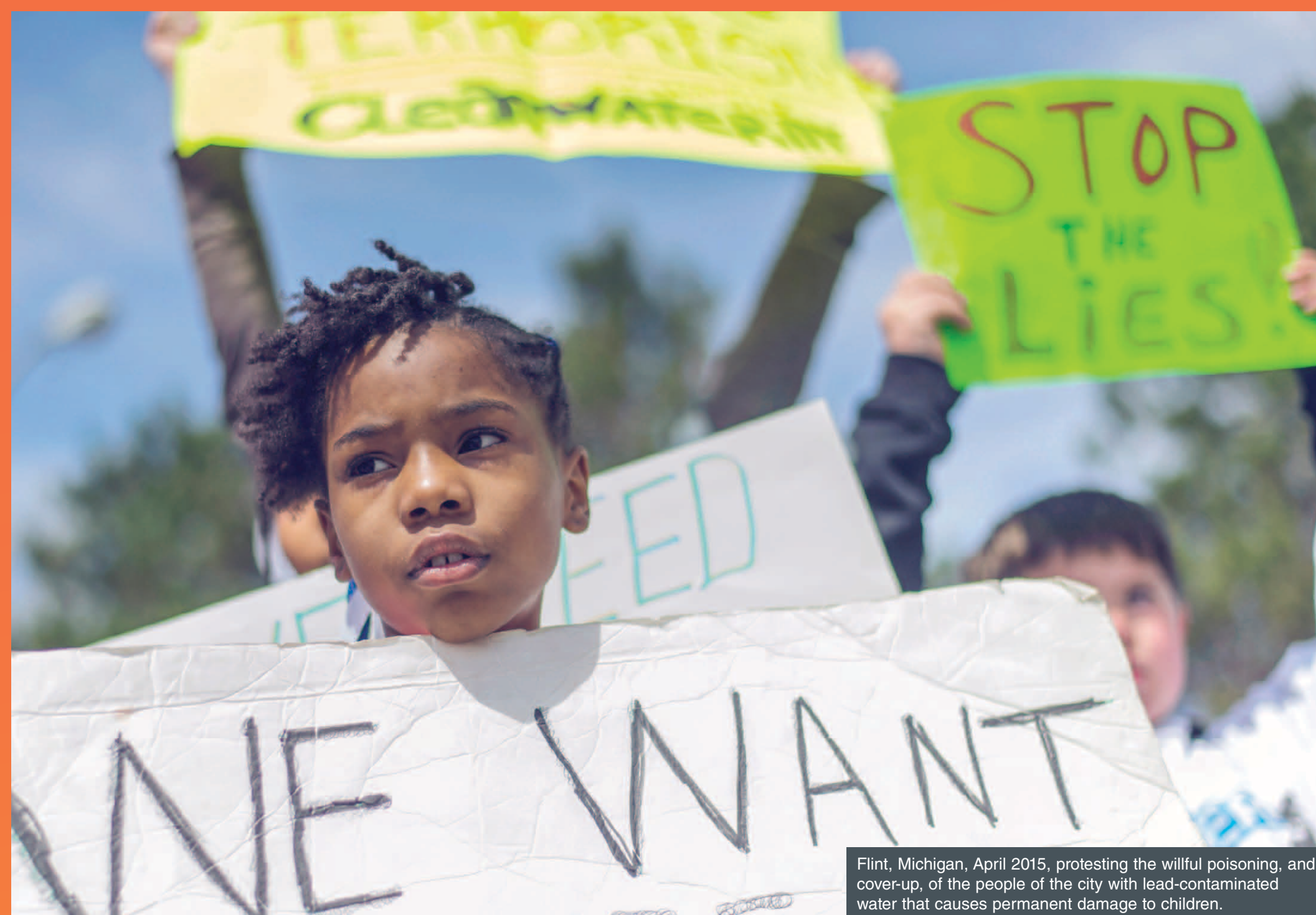
Flint, Michigan, April 2015, protesting the willful poisoning, and cover-up, of the people of the city with lead-contaminated water that causes permanent damage to children.