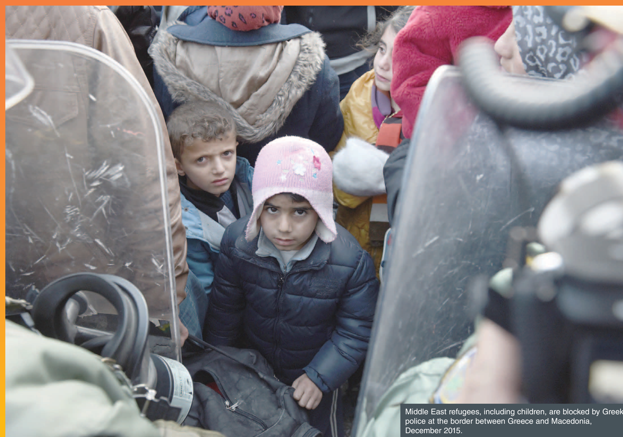
Middle East refugees, including children, are blocked by Greek police at the border between Greece and Macedonia, December 2015.