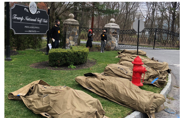
Refuse Fascism, Philly, protesters deliver body bags to Trump National Golf Course, NJ, April 4.

Get the Real Truth: Go to www.revcom.us for full documentation of above crimes and for coverage of the coronavirus pandemic.