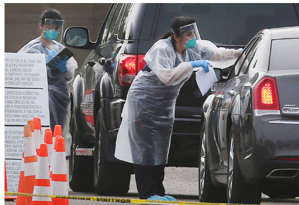
Medical students at Edinburg, Texas perform drive-thru COVID 19 testing, March 30.