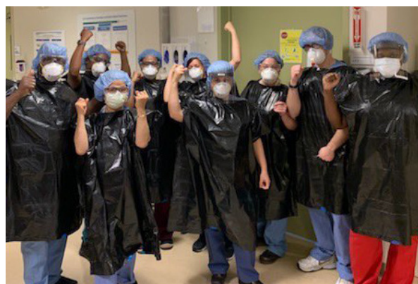
Massachusetts nurses wearing trash bag as protective gowns.