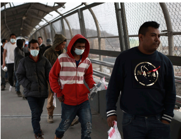
Asylum seekers from Central America forced back into Mexico at El Paso, TX, March 21.