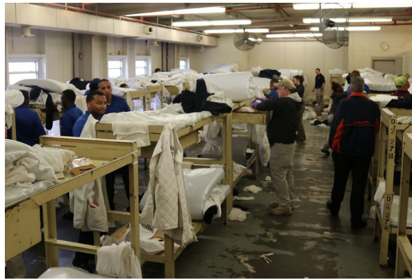
Prisoners packed in tight at Alabama’s Easterling Correctional Facility, February 25.

preventive measures. Thus Trump has basically issued a death sentence for thousands and thousands of prisoners.