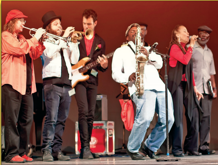
Special to Revolution

$10,000 toward a film of an extraordinary event