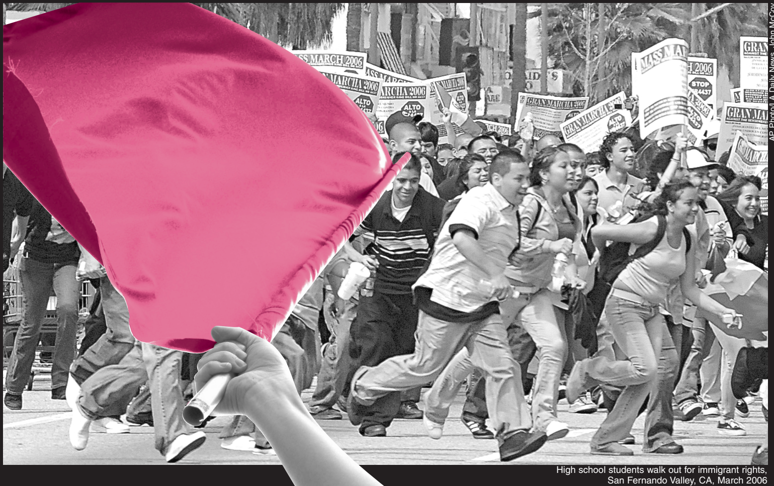
High school students walk out for immigrant rights, San Fernando Valley, CA, March 2006

the newspaper formerly known as the Revolutionary Worker