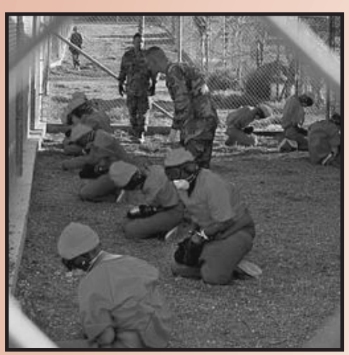
Torture of prisoners at Guantánamo