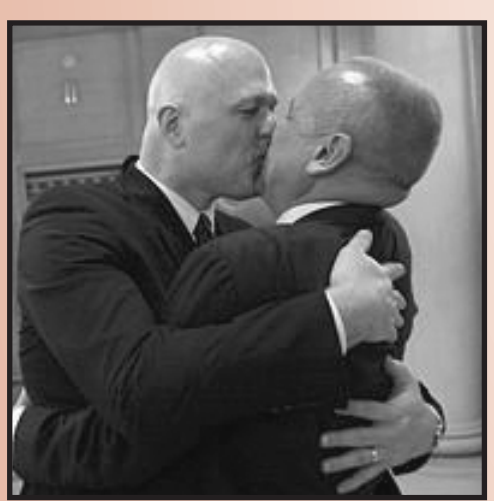
Two men getting married