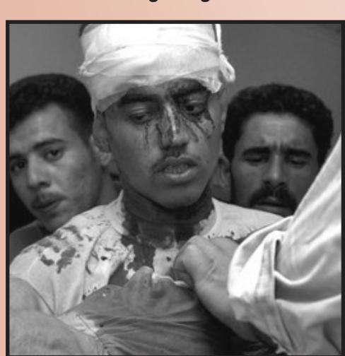
U.S. air strike on civilian areas in Iraq