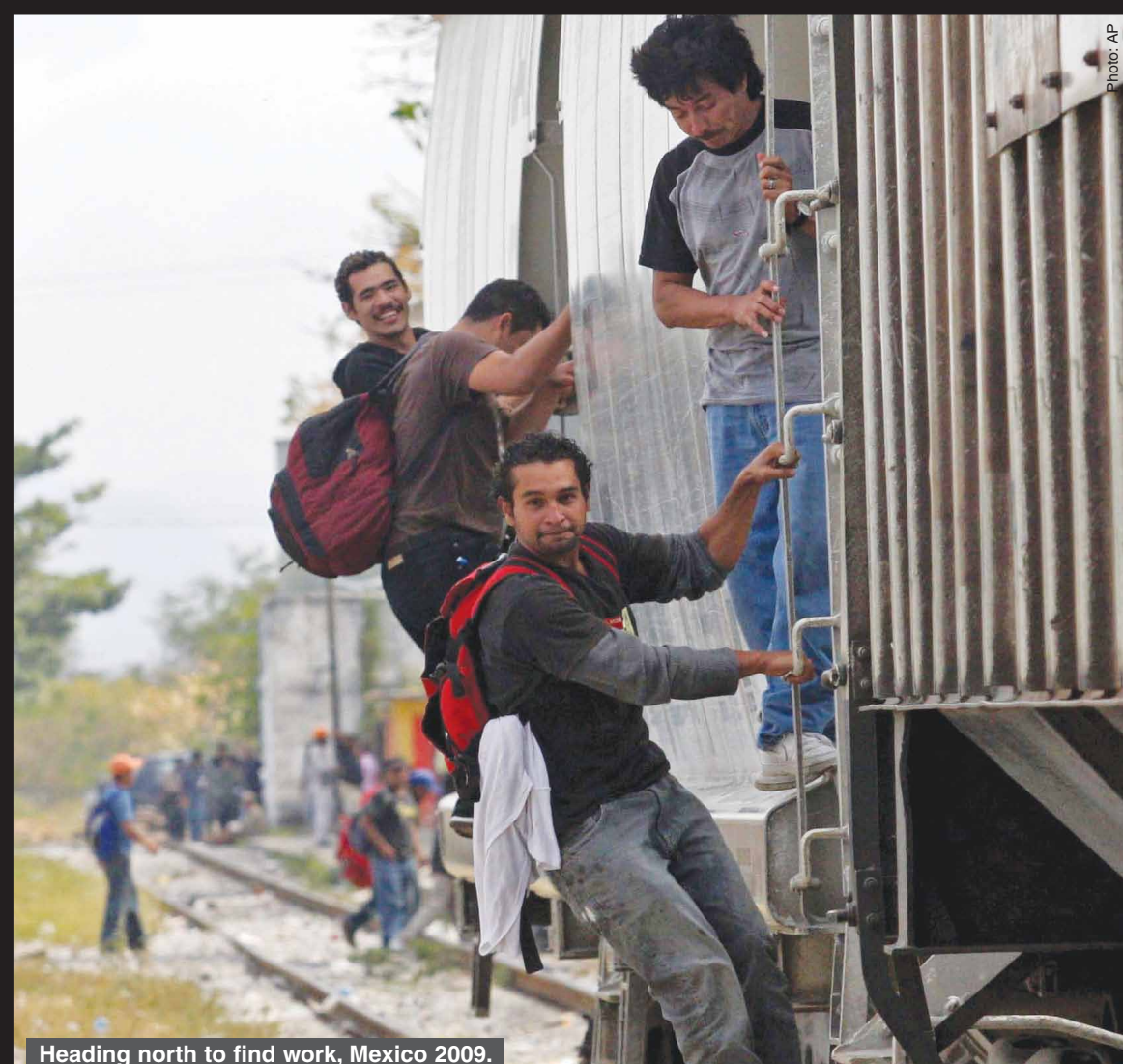
Heading north to find work, Mexico 2009.