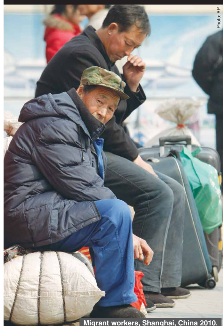
Migrant workers, Shanghai, China 2010.