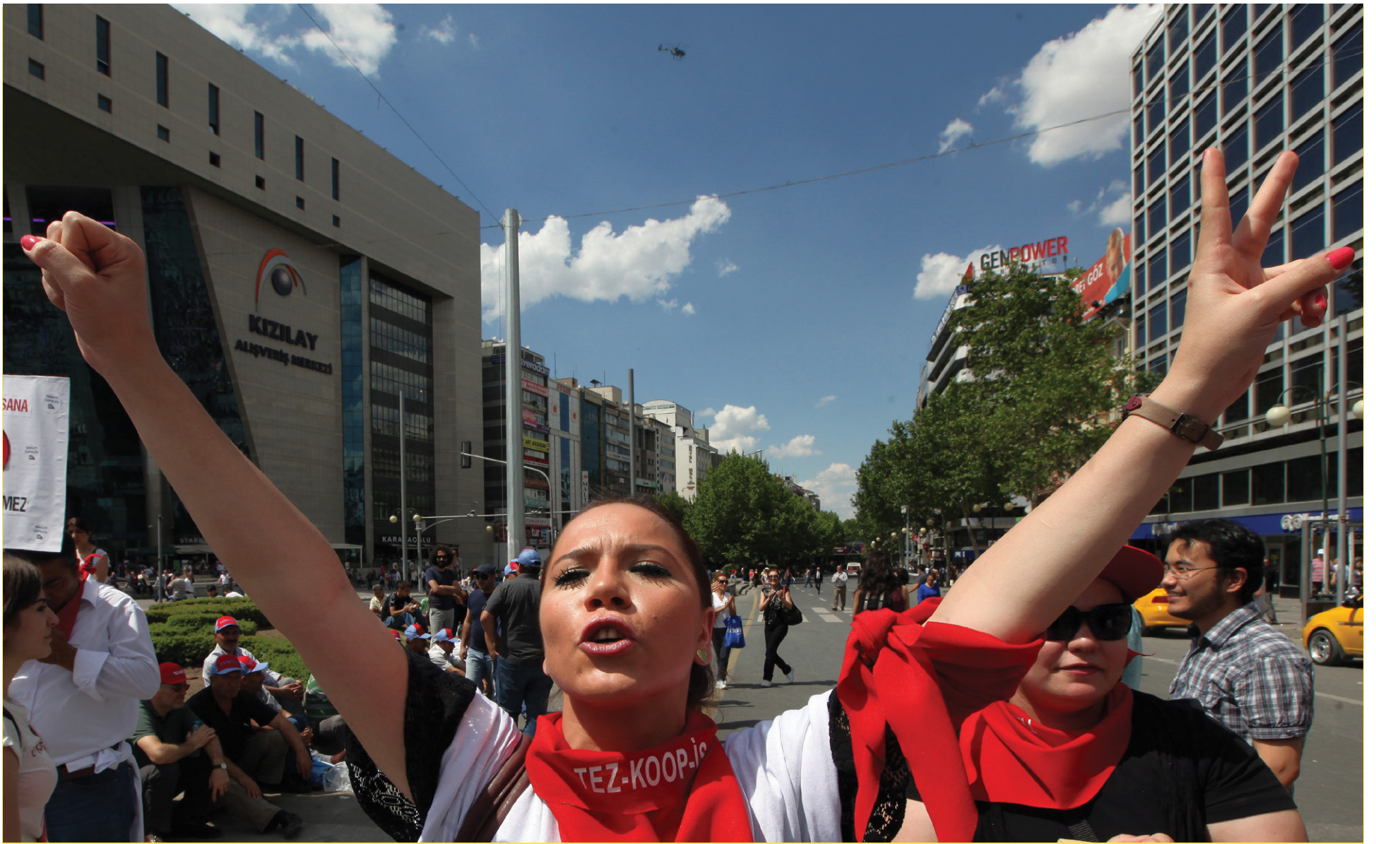
"It started out about a park, but now it's about everything," someone tweeted as protesters fought police in Istanbul's Taksim Square, June 5. In the clashes with police, countless women were in the forefront of the fighting for what they see as a clash over what kind of world they will live in.

No more generations of our youth, here and all around the world, whose life is over, whose fate has been sealed, who have been condemned to an early death or a life of misery and brutality, whom the system has destined for oppression and oblivion even before they are born. I say no more of that.