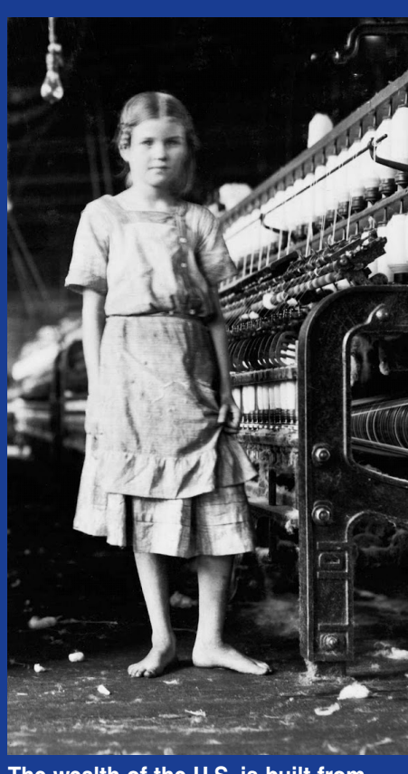
vicious exploitation for profit, including of children, without any regard for human lives.