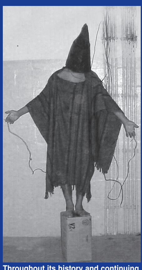
today, the U.S. has carried out bloody, reactionary wars to put down resistance of the oppressed and contend with rival powers.