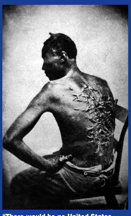
as we now know it today without slavery. That is a simple and basic truth." (Bob Avakian, BAsics 1:1)