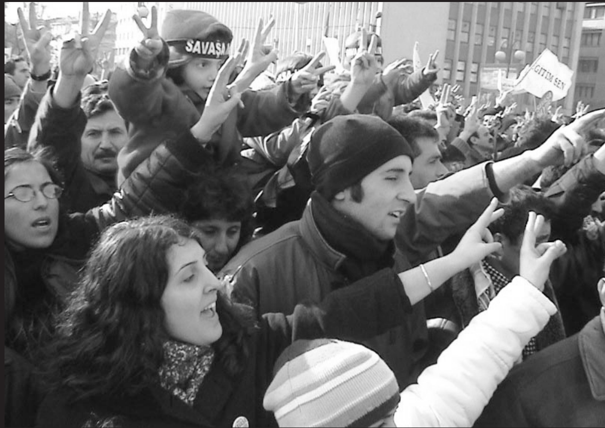
Ankara, Turkey, March 1, 2003.