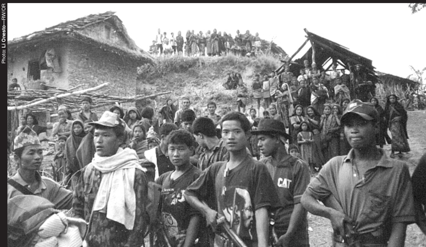
Revolutionary villagers in Nepal, 1999.

Support the People's Wars and Revolutionary Struggles Throughout the World