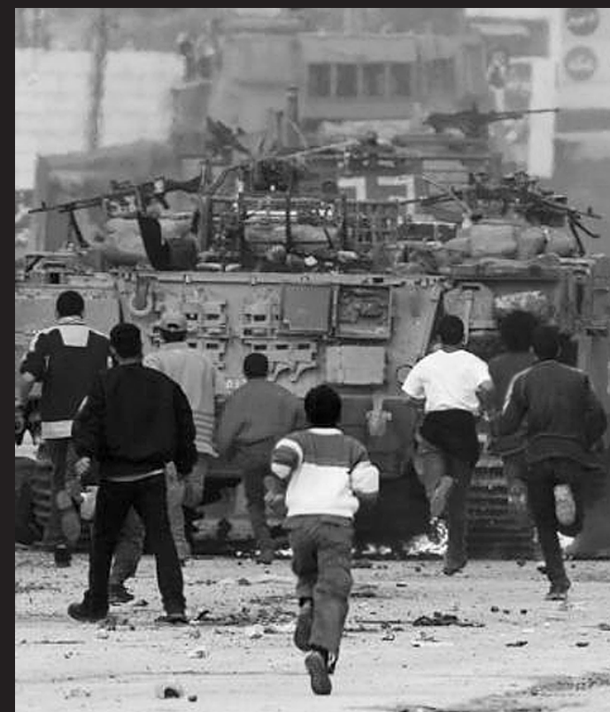
Palestinian youth vs. Israeli tanks.