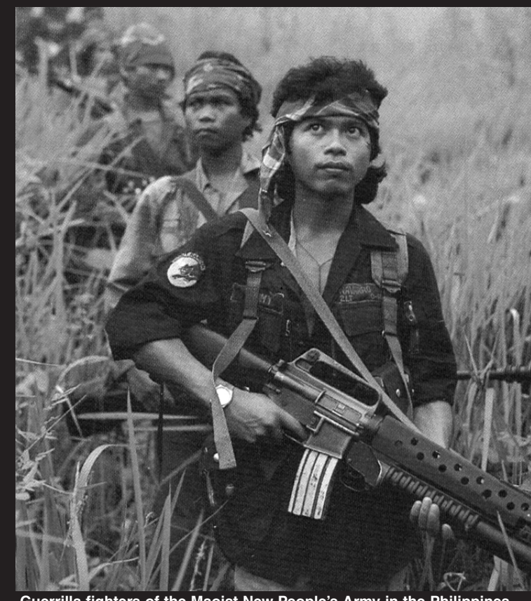
Guerrilla fighters of the Maoist New People's Army in the Philippines.

Break the Chains! Unleash the Fury of Women as a Mighty Force for Revolution!