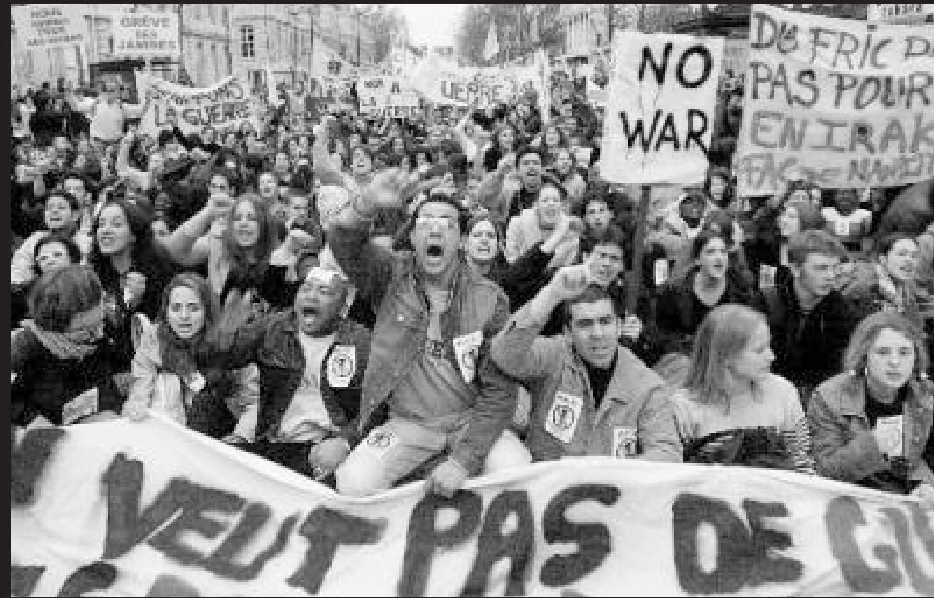
Paris, France, March 5, 2003.