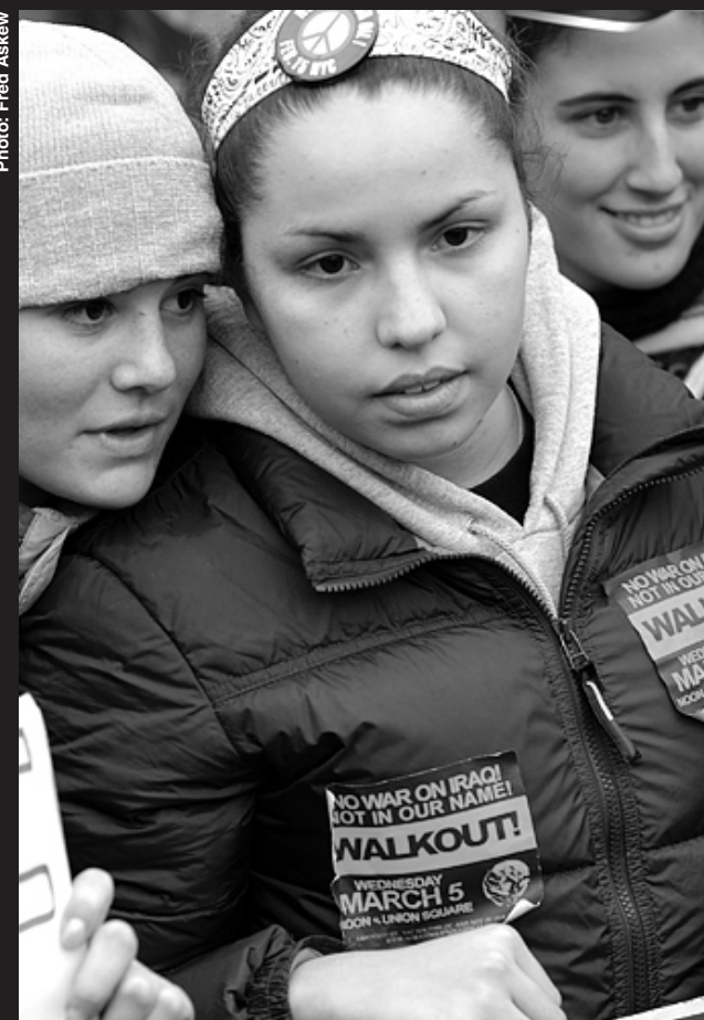
New York City, March 5, 2003.