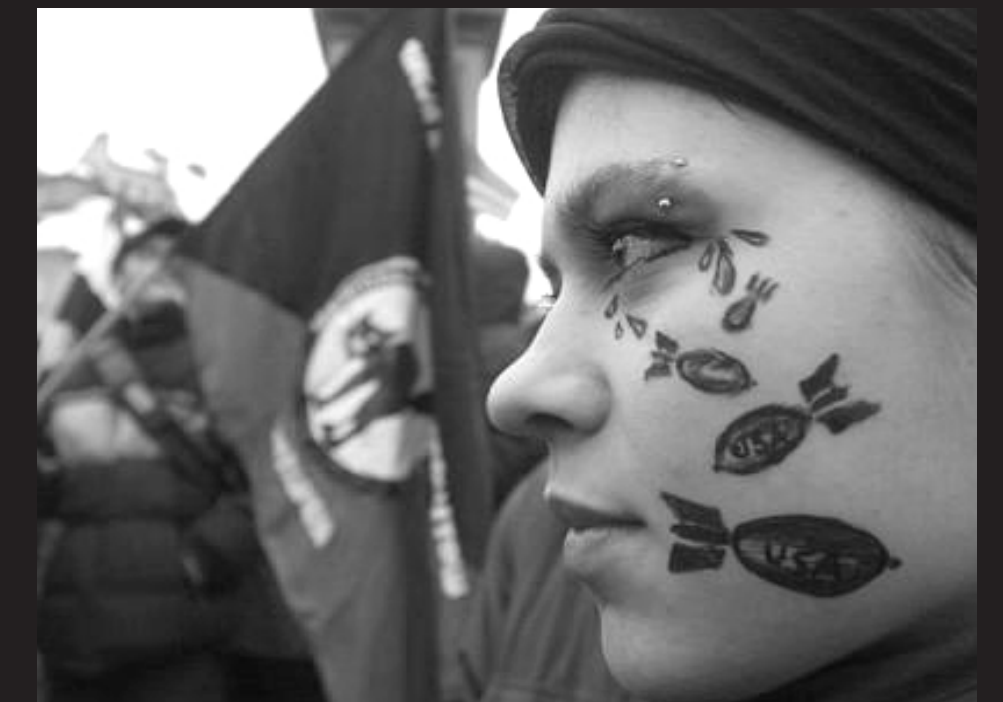
Warsaw, Poland, February 15, 2003.

The future is ours! We only want the world!