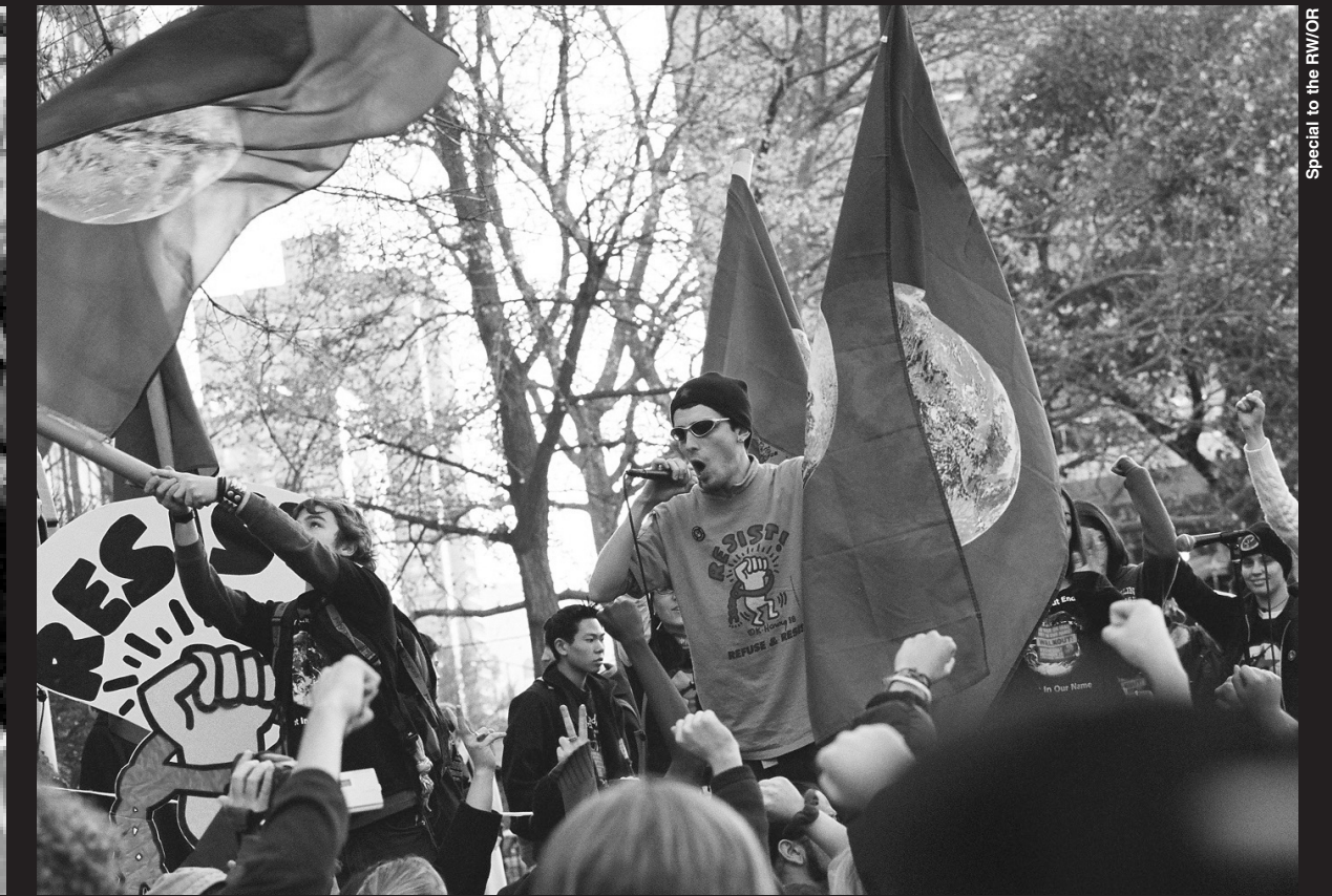
New York City, November 20, 2002.