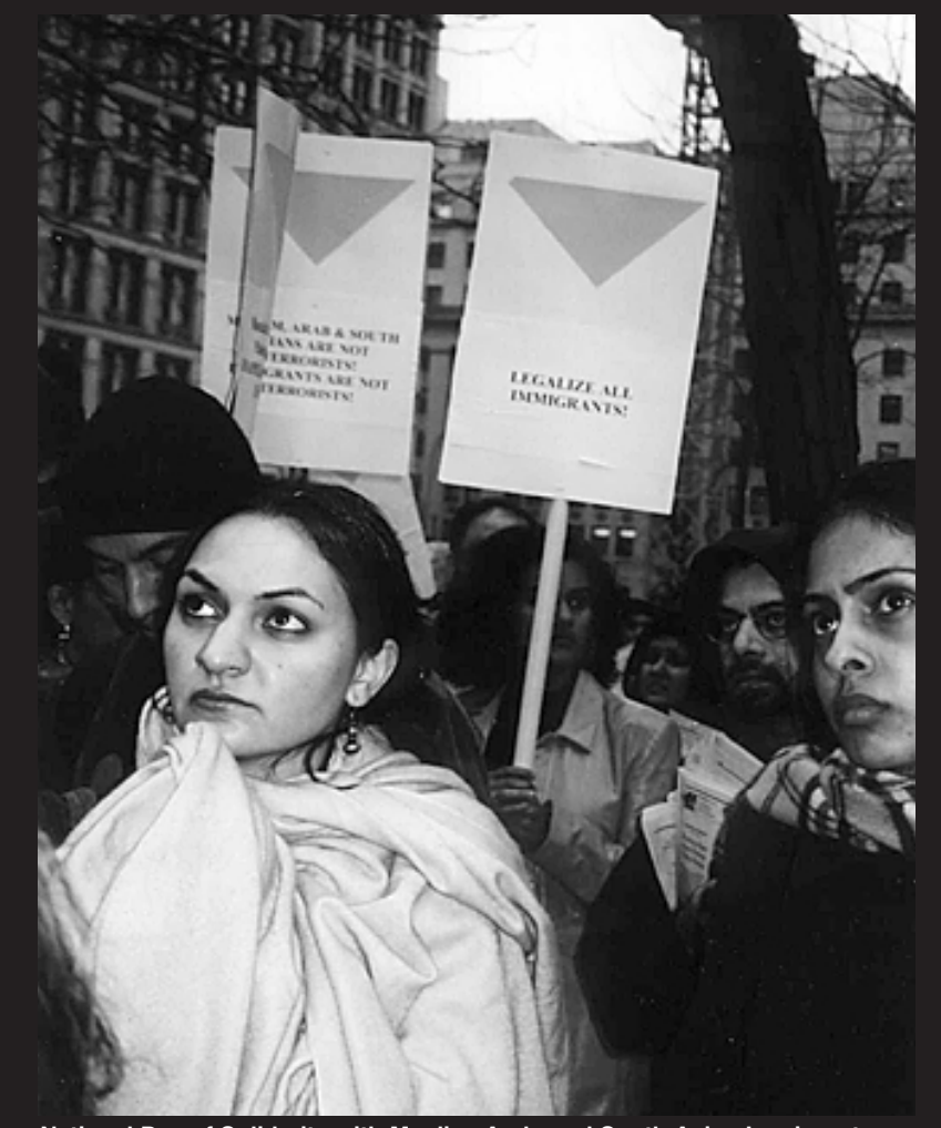
National Day of Solidarity with Muslim, Arab, and South Asian Immigrants, February 20, 2002.