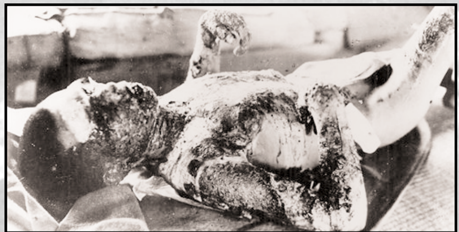
A victim of the atomic bomb in Hiroshima, Aug. 7, 1945.