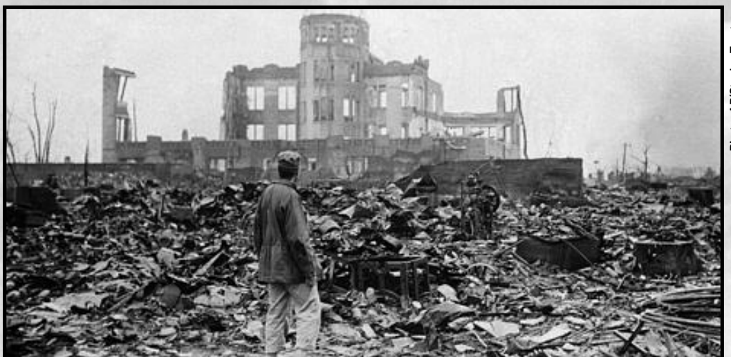
Hiroshima, a month after the dropping of the U.S. atomic bomb.