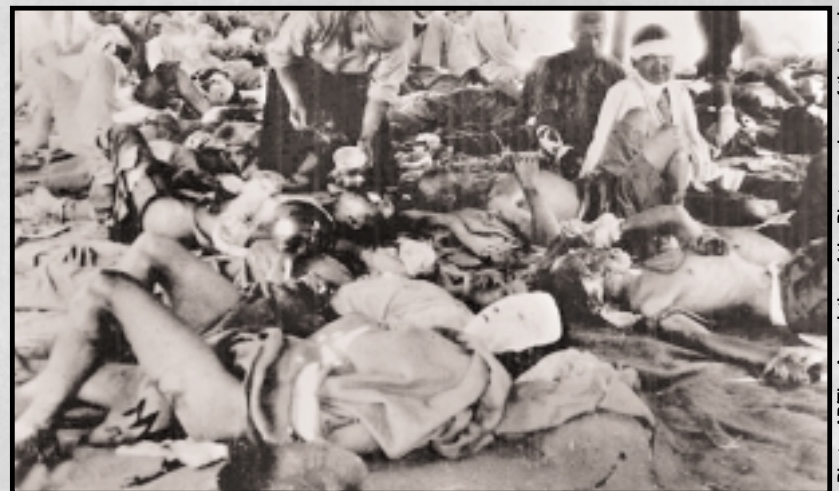
Atomic bomb victims in Hiroshima, Aug. 7, 1945.

“Hiroshima, Nagasaki...and Tehran?” From A World to Win News Service. See article on page 15 of this newspaper.