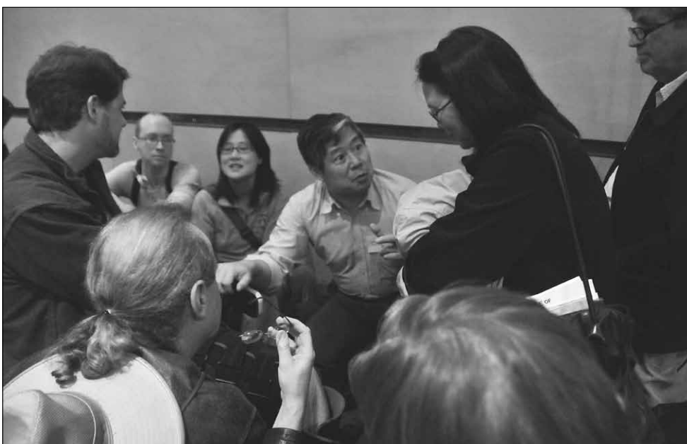
Special to Revolution