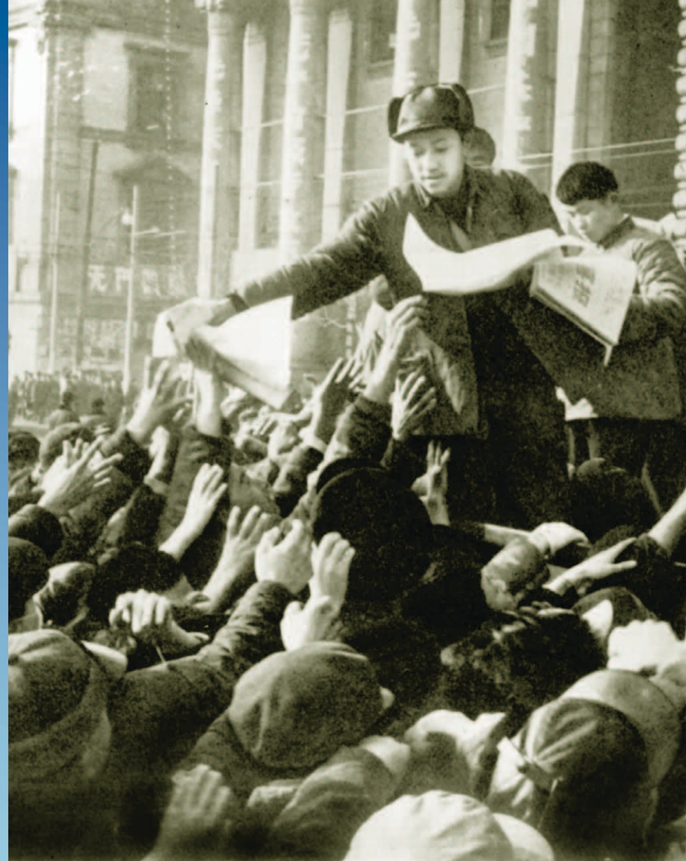
Shanghai, China, 1967. Revolutionary literature is distributed during the January Storm.