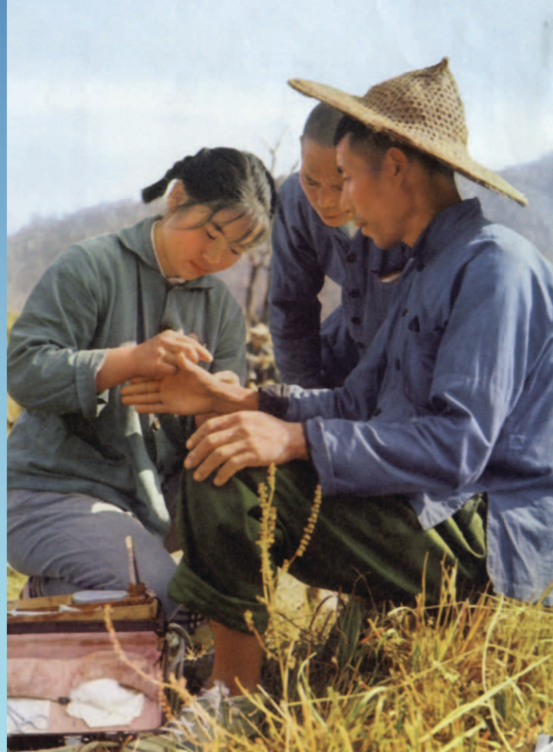
China, 1971. Barefoot doctor brings medical care to the countryside.