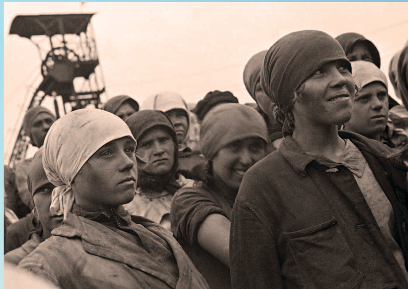
Soviet Union, 1930. Young women, members of the communist youth group Komsomol, volunteer to work in the mines.