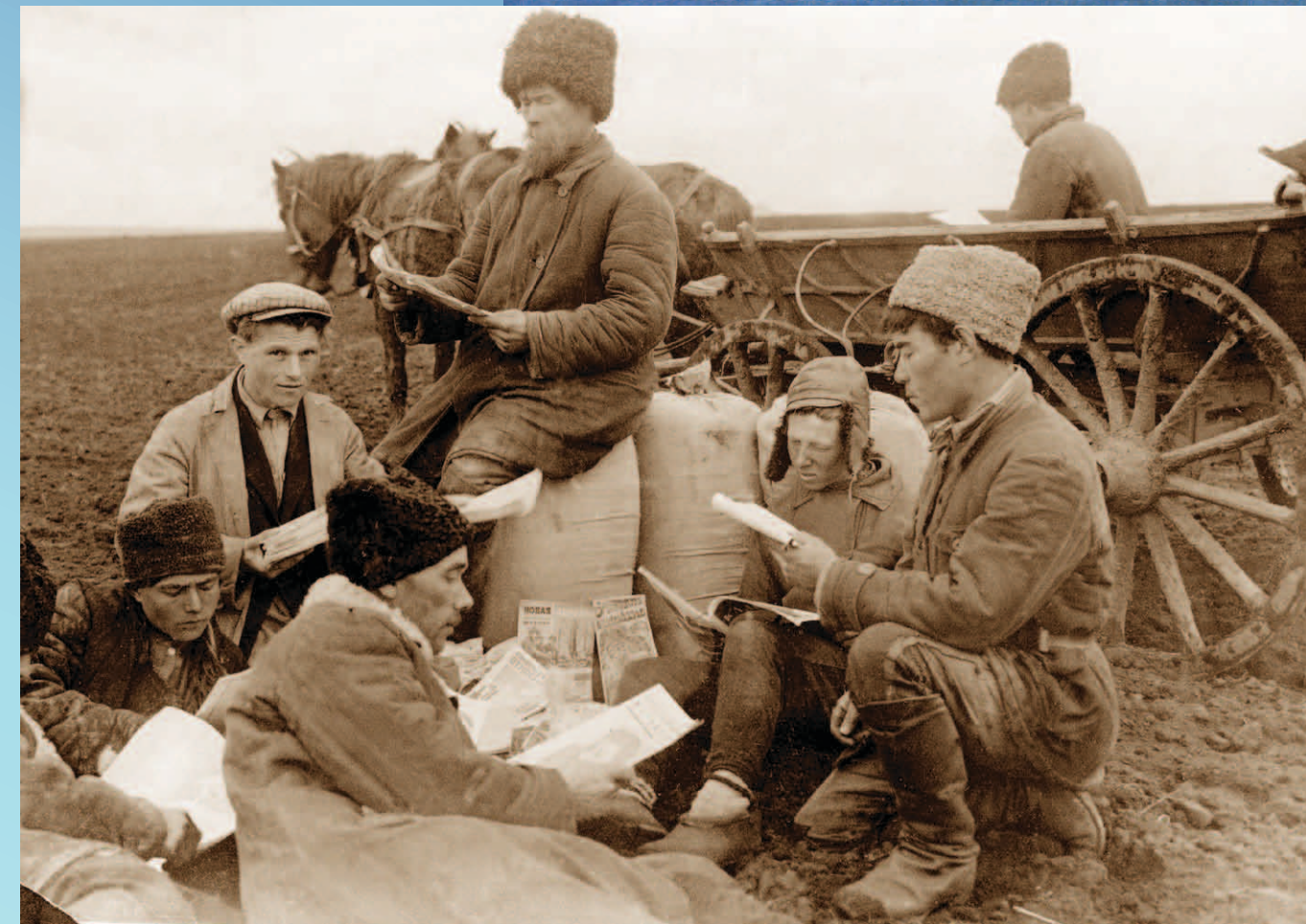
Soviet Union, 1930. In a campaign to overcome illiteracy among peasants the government sent millions of books, newspapers and magazines to the countryside.