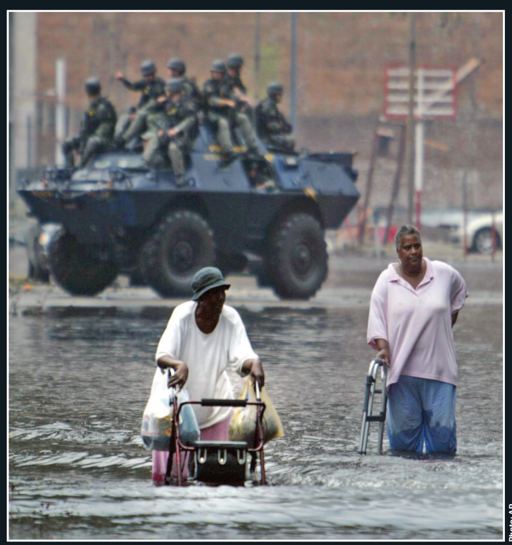
10 years ago, 2005: After Hurricane Katrina devastates New Orleans, the authorities leave Black people to die, with no food or water or herded into the Superdome like cattle. People worked together to get food and water. People trying to cross the Danziger Bridge to escape the flood are shot by police.