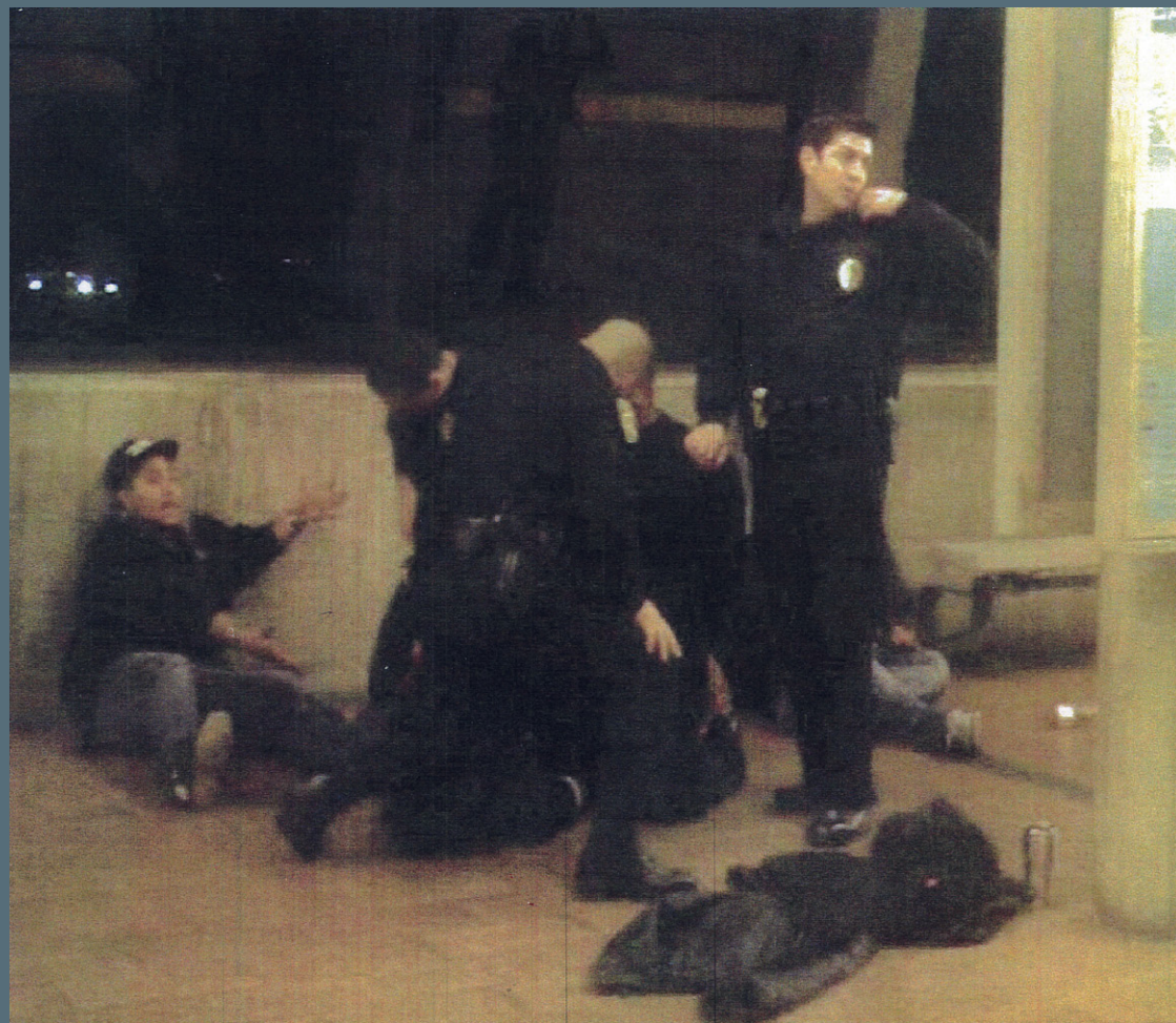
Oscar Grant, murdered by police in Oakland, California, New Year's day, 2009