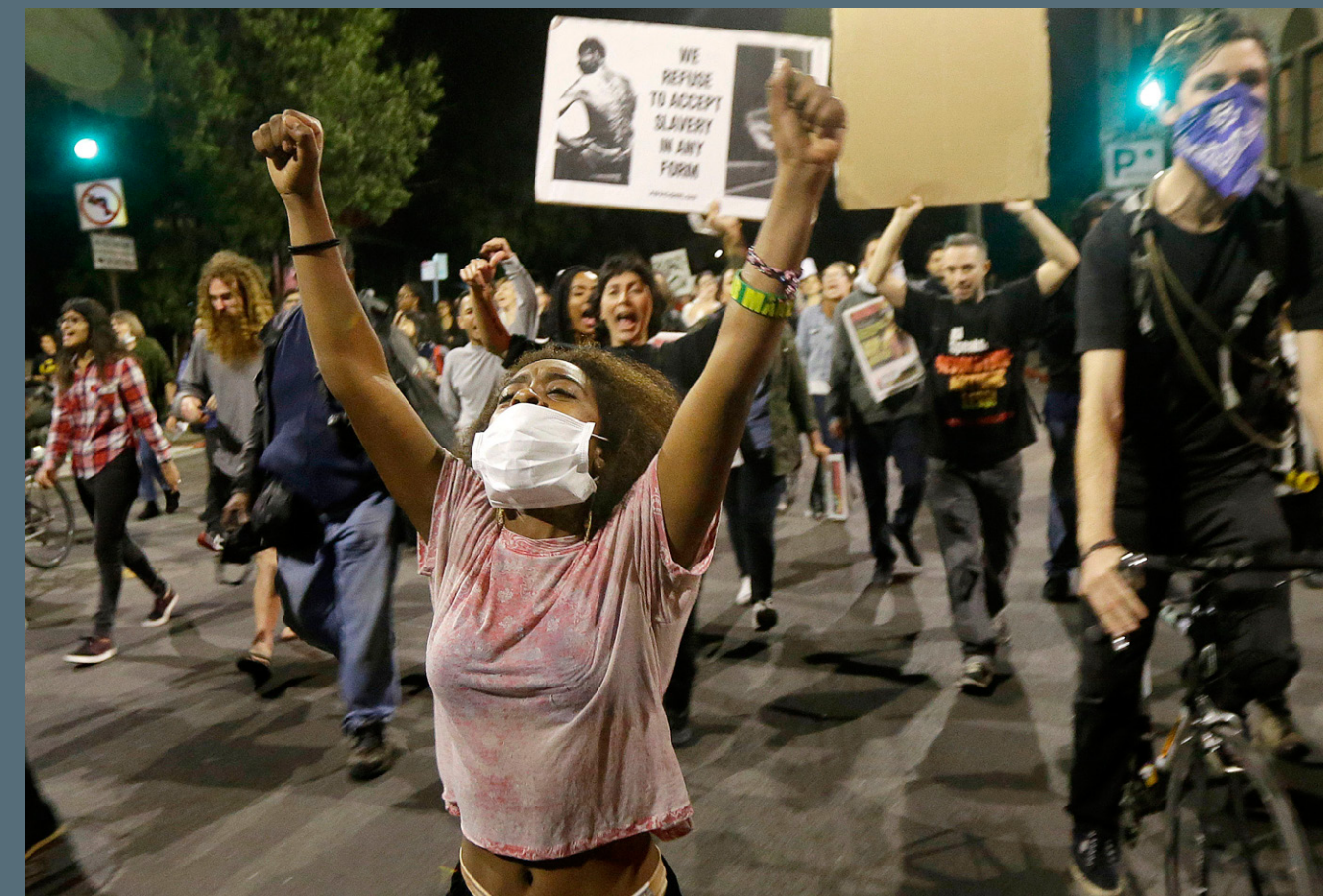
Berkeley, CA, December 2014

Lives are at stake. Be part of determining the outcome.