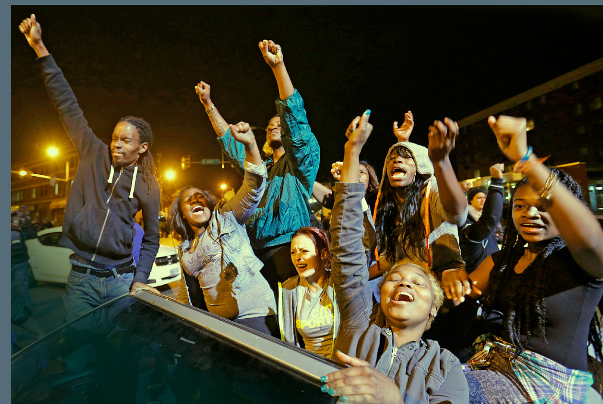
Baltimore, MA, May 2015