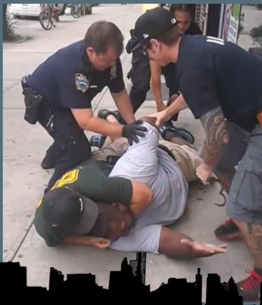
Eric Garner, murdered by police in NYC, July 2014