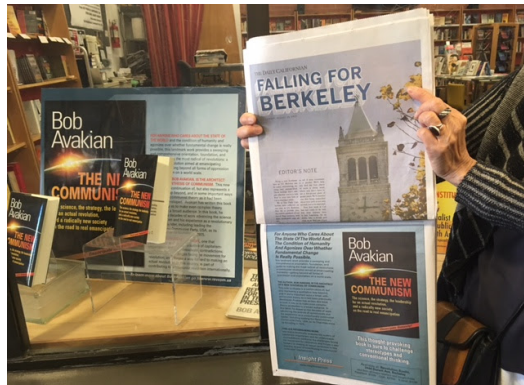
UC Berkeley Daily Cal ad -- in front of Berkeley Revolution Books

Write us your experience & send pictures to info@insight-press.com .