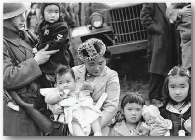
"Suffer the little children to come unto me for of such is the kingdom of Heaven." Matthew 19:14

People of faith, of all religions, of such did we see torn from mothers and fathers during the brutal years of slavery in this nation.