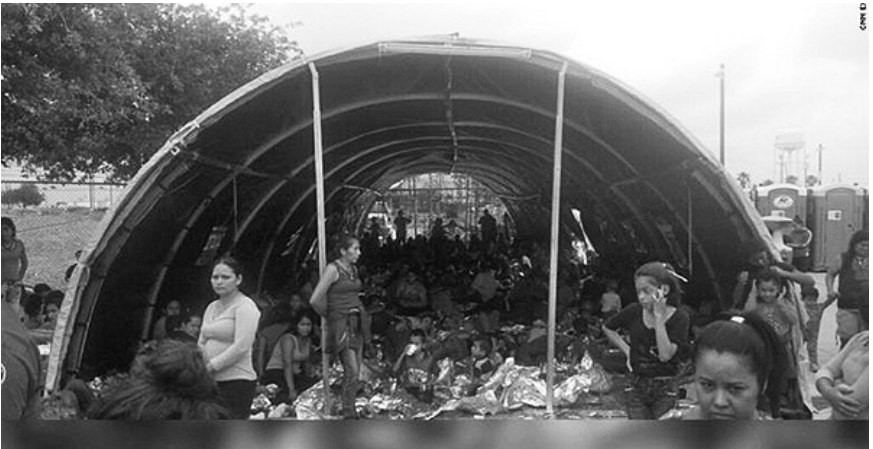
May 2019, flooded tent at a concentration camp near McAllen, TX (obtained by CNN from an unnamed person).