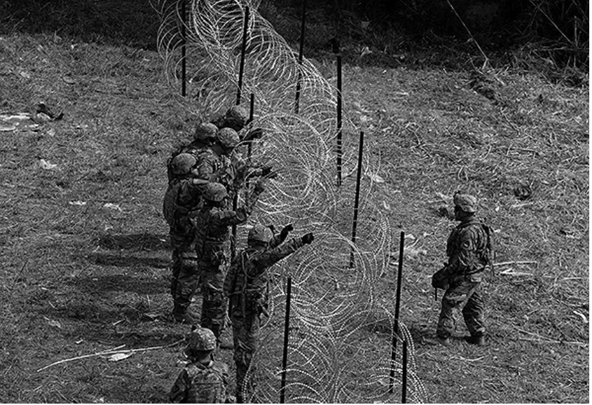
The U.S. military place razor wire along the U.S.-Mexico border near the McAllen-Hidalgo International Bridge in McAllen, Texas, November 2018.