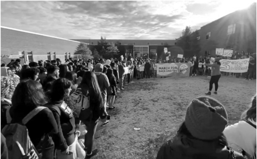
Oklahoma high school students walking out of US Grant in support of DACA recipients and all our immigrant communities.

In March 2017, the Trump regime announced that it was suspending travel of all refugees into the U.S. for 120 days, while