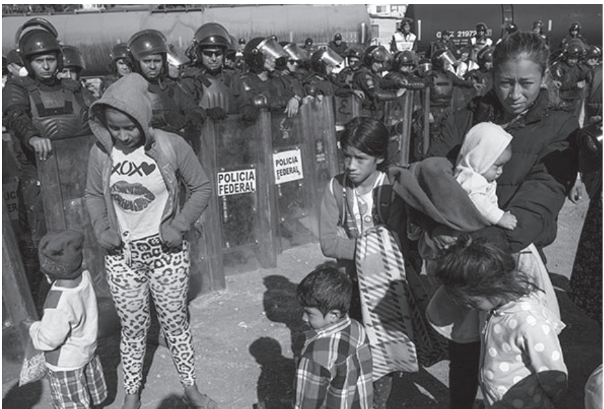
Tijuana, November 25, 2018, on the U.S.-Mexico border. People who had walked thousands of miles to apply for asylum were confronted by riot police, helicopters, machine guns, and soldiers. Border Patrol threw tear gas at these migrants, including small children and babies.