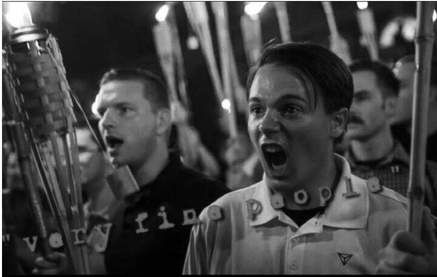
Fascists and white supremacists marching in Charlottesville, Virginia, August 2017. Trump called them “very fine people.”

(If you think this is an exaggeration—going too far to say this about Trump—then you still don't know who Donald Trump really is. Look for Part 6: further evidence of Donald Trump as a genocidal racist.)