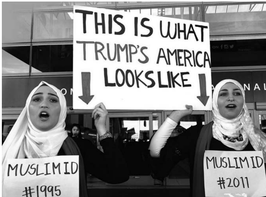
Two women, born in the U.S. of parents originally from Syria, take part in a protest at LA International Airport against Trump’s Muslim ban, aimed at people from countries where Islam is the main religion, January 30, 2017.

(If you still don’t think Trump would do something as extreme as killing off large parts of those he has demonized and criminalized, you still don’t know who Donald Trump really is. Look for Part 5: further evidence of Donald Trump as a genocidal racist.)