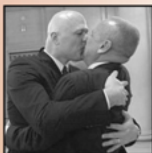
Two men getting married