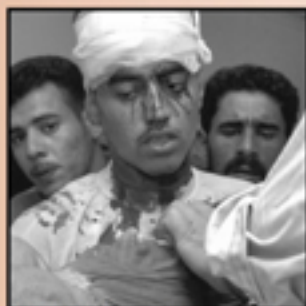
U.S. air strike on civilian areas in Iraq