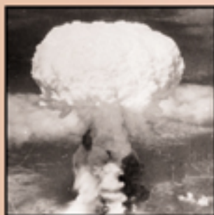
U.S. atomic bombing of Hiroshima

This week's contestant is none other than the Chairman of the Joint Chiefs of Staff - General Peter Pace!