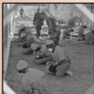
Torture of prisoners at Guantanamo