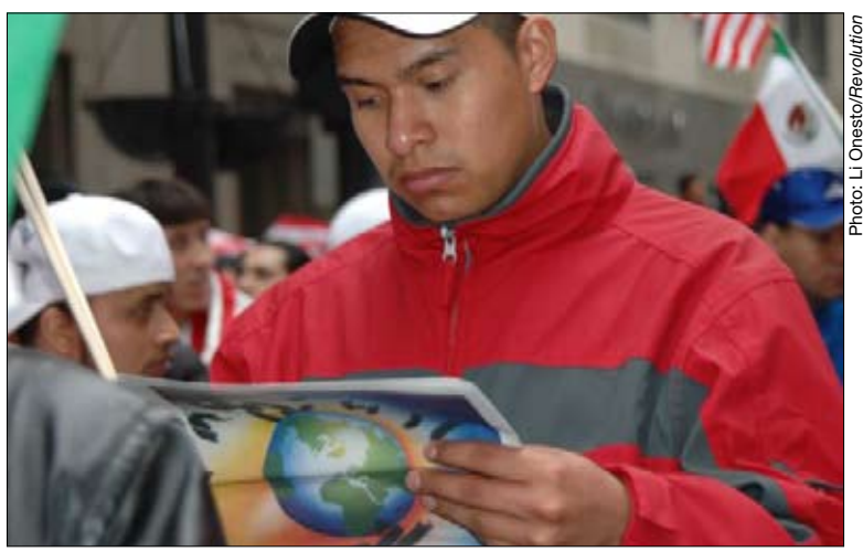
May First march for immigrant rights, Chicago, 2006.