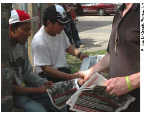
Migrant workers in New Orleans, 2006.

VOLUNTEER FOR, AND SUPPORT, THE REVOLUTION INITIATIVE! \Box