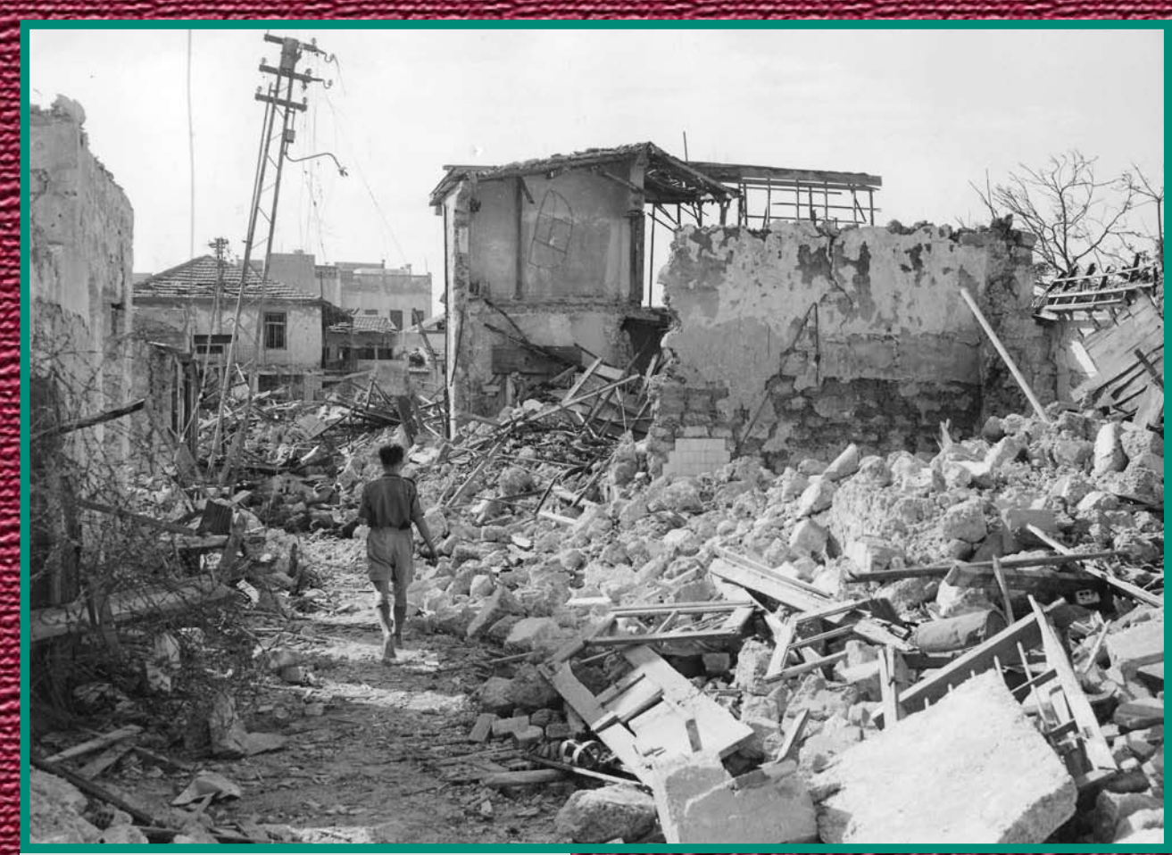
The Manshiah quarter in Jaffa, home to Palestinians, after it was destroyed by Irgun Jewish forces, May 1948.

How many times have you had a discussion about the plight of the Palestinians with supporters of the state of Israel and met the argument that the problem is the Palestinian "intolerance" of Jewish settlers? People have been taught that Israel was established as the result of a heroic fight for their homeland up against an "inhuman" enemy. But the reality is far different.