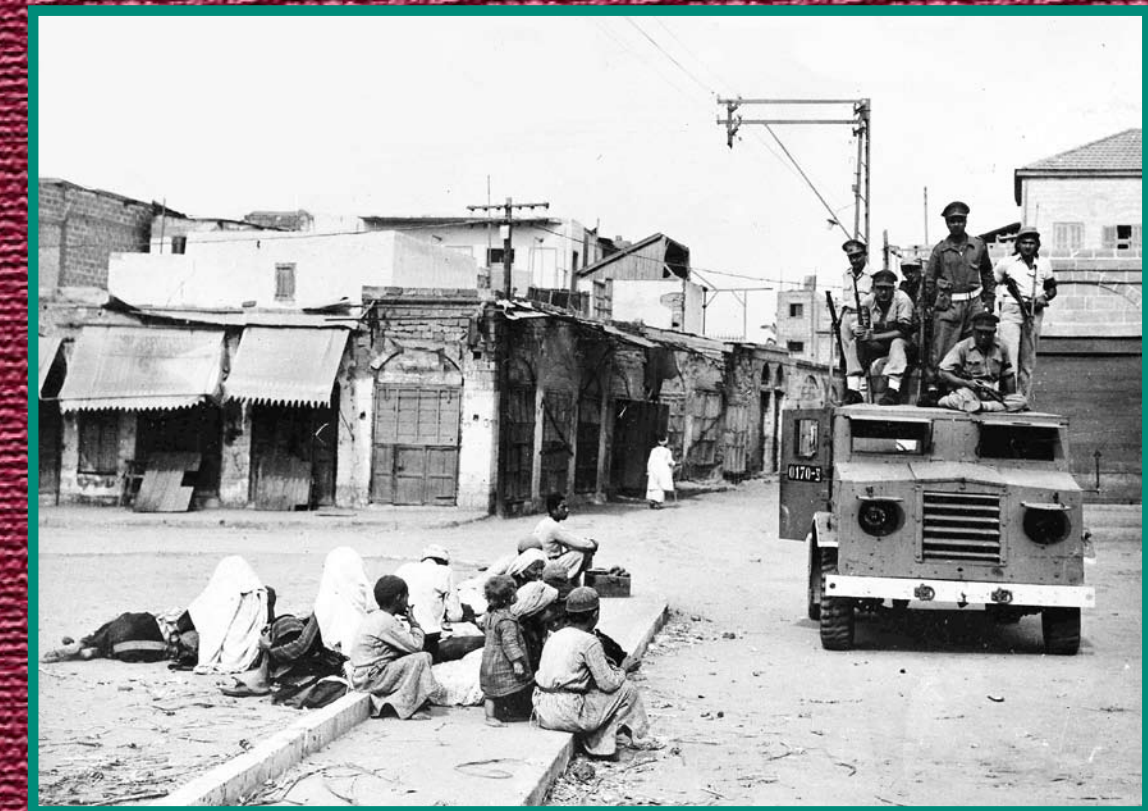
alestinian residents watch Israeli occupation orces entering the town of Majdal, November 1948.

Palestinians call what happened to them from 1947 to 1948 the Nakba —Arabic for catastrophe. During the Nakba, almost a million Palestinians were brutally forced from their land, villages and homes, fleeing with only the possessions they could carry. Many were raped, tortured and killed. To ensure that there would be nothing for the Palestinians to return to, and to wipe out physical evidence that the land belonged to Palestinians, their villages and olive and orange trees were thoroughly razed. By the time the Nakba ended, there were 31 documented massacres, and probably many others. Over 530 Palestinian villages and 11 urban neighborhoods were emptied of their inhabitants.