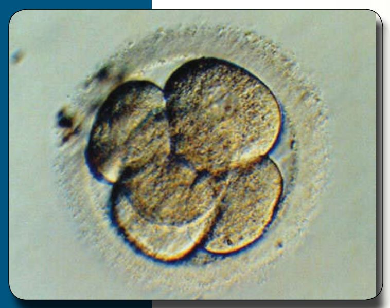
Several day embryo clump of cells

When it comes to abortion, there really is only one moral question: Will women be free to determine their own lives, including whether and when they will bear children, or will women be subjugated to patriarchal male authority, whether it comes down at the hand of another person or the church or the government, and forced to breed against their will?