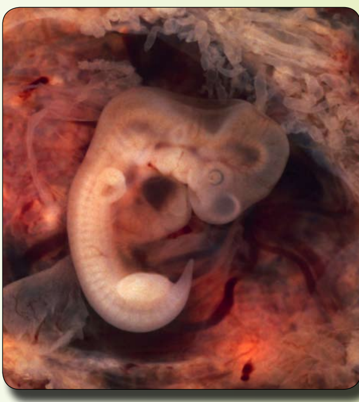
Five week embryo

A fetus is not yet a human being. It is nothing but a clump of cells with the potential to become a human being. It is "alive," but that is also true of all the other cells in a woman's body. It has no life of its own yet. It is not yet a separate life from the life of the woman in whose uterus it is.