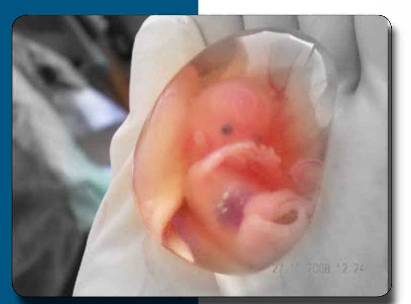
Above: Ten week fetus

The anti-abortionists carry big signs showing fetuses floating around in a woman's uterus, as if they are totally separate from women. But contrary to how they portray things, an embryo or fetus can't survive on its own. It gets oxygen from woman's blood, excretes waste through the woman ... And this is true until the fetus is born and becomes a baby. It is no more an independent human being than any other organ or part of a woman's body.