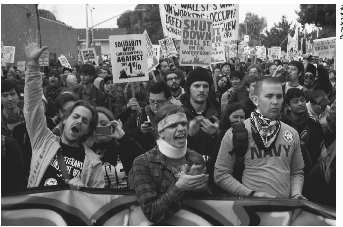
December 12 —Coordinated actions by West Coast Occupy movements disrupted, and in some cases shut down, ports up and down the West Coast. These actions by thousands and thousands, were a significant continuation of resistance to the heartless and oppressive domination and way of life under this society. The actions also represented a powerful response by the Occupy movement to a coordinated nationwide effort by authorities to attack and crush the movement with police raids and brutality, and to coerce the movement into acceptable channels.

A fresh wind of resistance rose up in September when people occupied Zuccotti Park near Wall Street, the financial heart of the U.S. empire. The Occupy protests spread to cities across the U.S., bringing to the surface profound discontent with the inequality and injustice in this society, and this movement has raised the hopes of millions in this country and worldwide. The atmosphere and discourse in society is changing, and millions are thinking about and asking big questions about the ways things are—and whether and how a different future would be possible. This movement has been repressed by the powers-that-be in what appear to be coordinated attacks to savagely evict encampment after encampment across the country. As 2011 comes to a close, this movement stands at a crossroads.