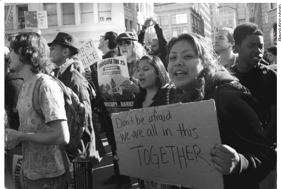
Occupy Oakland marching on the day of the general strike.