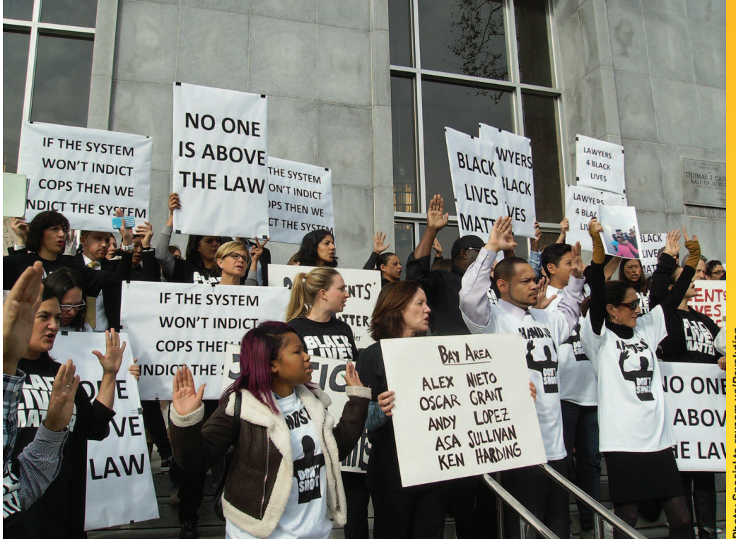
an Francisco public defenders, December 1