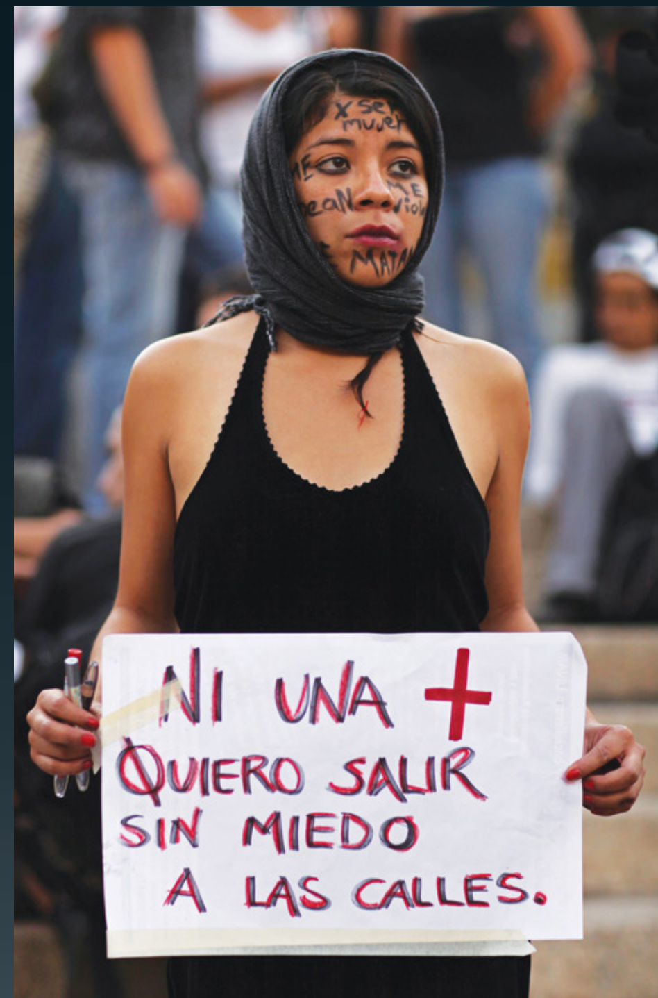
International Women's Day protester with a sign saying "Not one more, I want to go into the streets without fear." Mexico City, Mexico, March 8, 2011.

Prepare the Ground, Prepare the People, and Prepare the Vanguard— Get Ready for the Time When Millions Can Be Led to Go for Revolution, All-Out, With a Real Chance to Win.