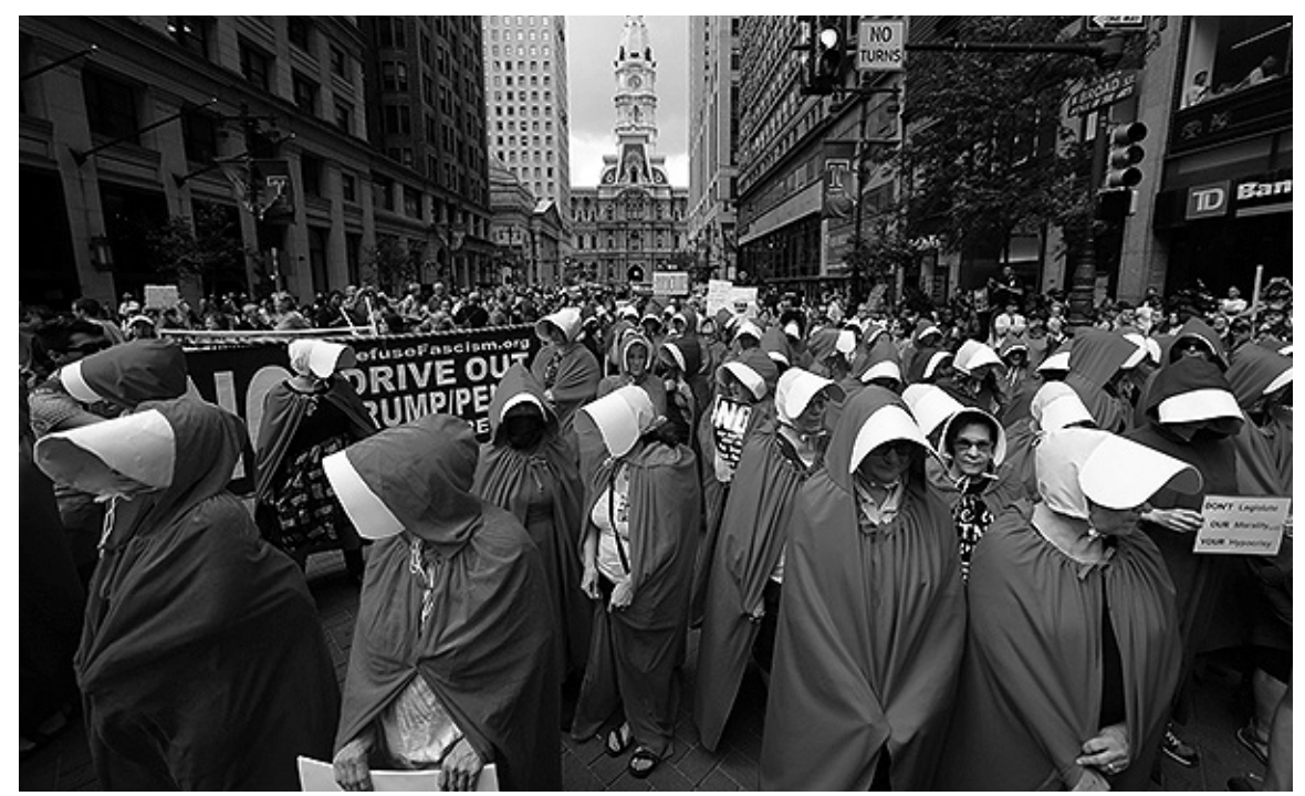
Handmaid's Tale protest against Vice President Mike Pence, Philadelphia, July 24, 2019.

Also in November, the Trump administration proposed a new rule that would allow faith-based foster care and adoption agencies (which are often the only such agencies) to continue to receive federal funds even if they discriminate against LGBTQ people.