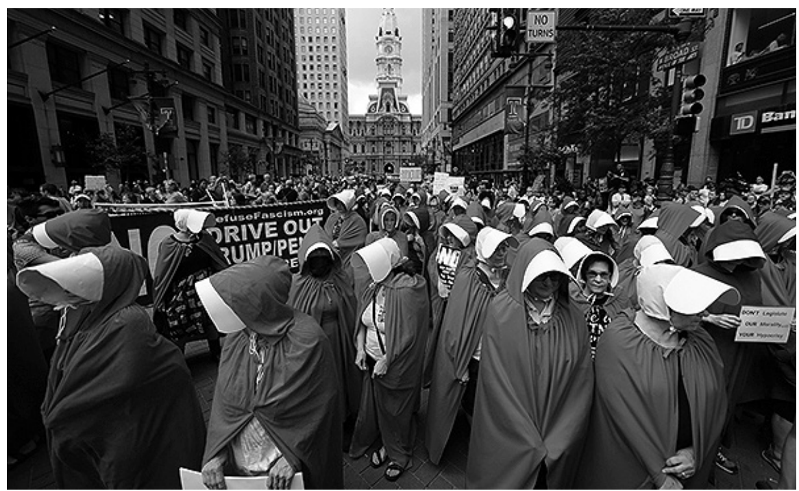
Handmaid's Tale protest against Vice President Mike Pence, Philadelphia, July 24, 2019.

Also in November, the Trump administration proposed a new rule that would allow faith-based foster care and adoption agencies (which are often the only such agencies) to continue to receive federal funds even if they discriminate against LGBTQ people.