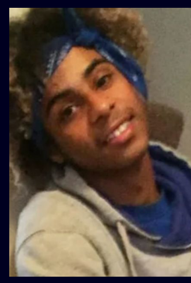
5-30-20, Shot to death by a