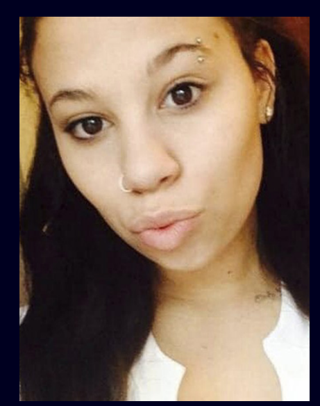
6-1-20, Shot and killed by a white 6-1-20, Shot dead by four cops man while leaving a peaceful BLM during a George Floyd protest in protest, Davenport, IA