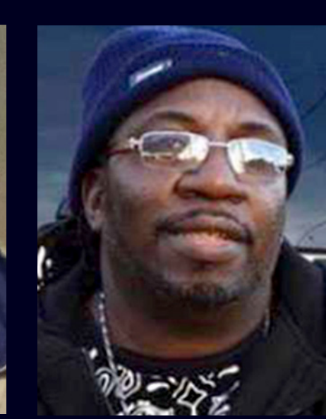
6-1-20, Fatally shot by the