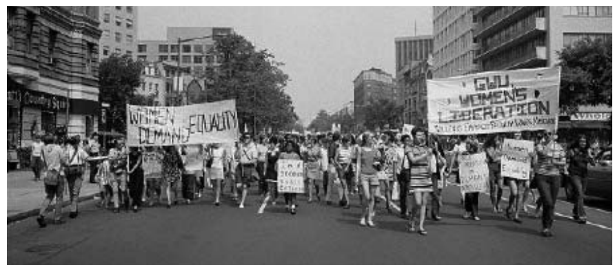
The 1960s and '70s have seen political and legal changes that have brought certain extensions of formal rights to women.