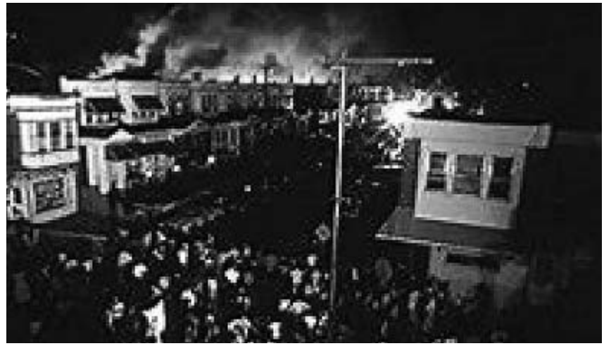
May 13, 1985, an example of brutal repression at home was the MOVE massacre. Police dropped two bombs on the MOVE house killing six adults and five children, and burning 61 homes.

This brings us to a most fundamental point that is so often ignored or glossed over in discussions and debates about democracy in countries like the U.S.: The fact is that even the extent to which rights are allowed to the nonruling classes in imperialist countries depends on a situation where, in large parts of the world under imperialist domination, the masses of people are subjected to much more open and murderous repression. In short,