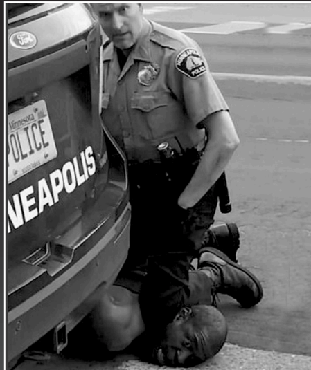
U.S. Police Murder