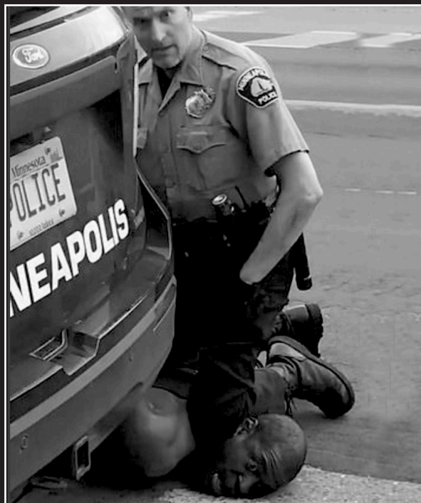
U.S. Police Murder