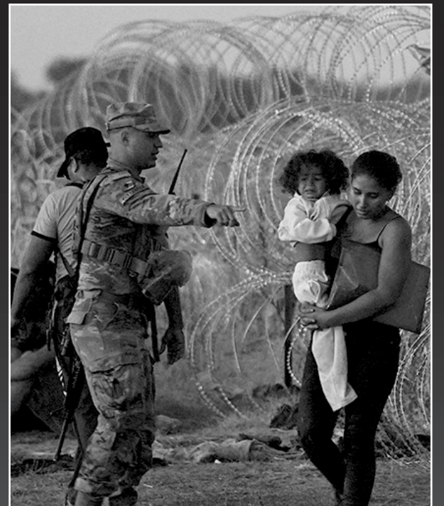
Refugees at U.S. Border