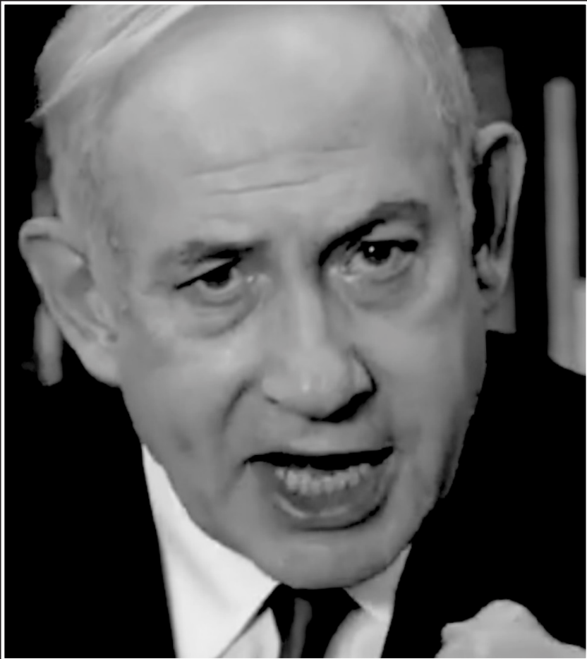
Benjamin Netanyahu Alias: "NETAN-NAZI"