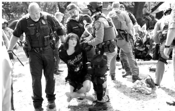
University of Texas 2024

6pm Friday October 18 Revolution Books 2444 Durant Avenue