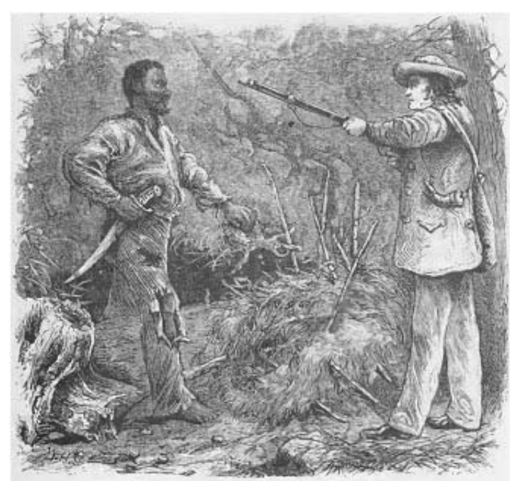
Nat Turner, illustrated above, led an uprising that deeply shook the slave system, and there was a huge, brutal response from those in power.